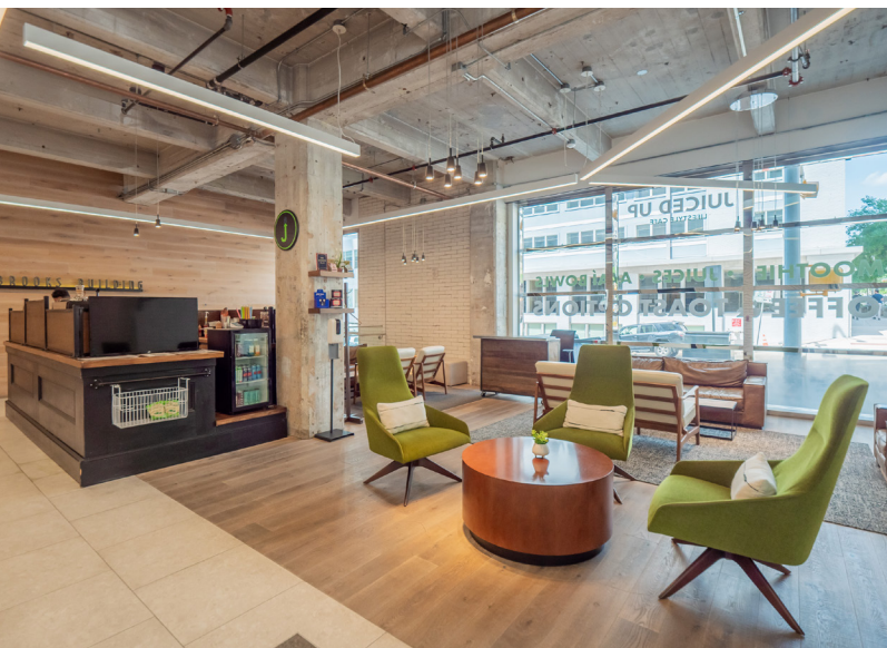
Pictured: Building Lobby