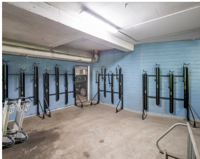
Pictured: Bike Storage