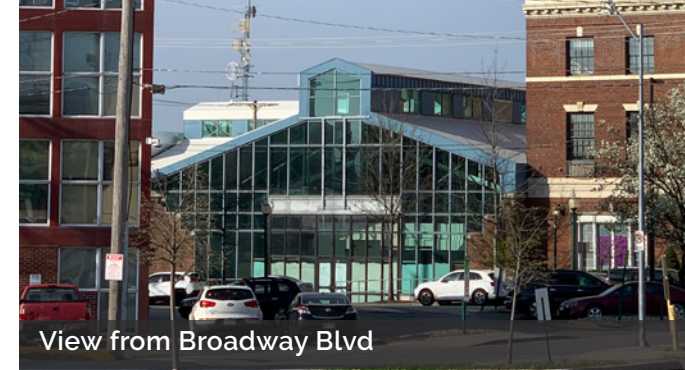
View from Broadway Blvd