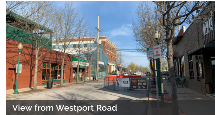
View from Westport Road