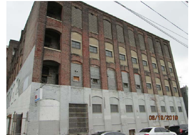
1 EXISTING ELEVATION FACING ROSEHILL STREET SK.1 SCALE: 1/8" = 1'-0"