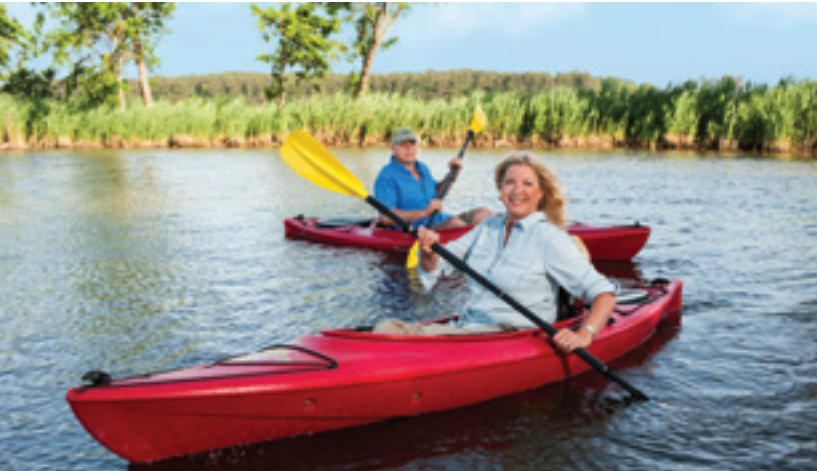
Outdoor Adventure: Enjoy birdwatching, cycling, hiking and paddling throughout the county and at the 28,000-acre Blackwater National Wildlife Refuge.