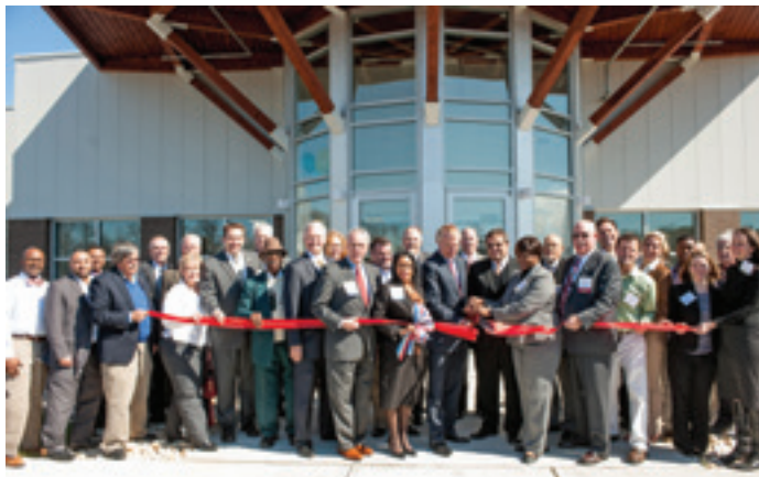
The Eastern Shore Innovation Center, the Tech Park's anchor tenant, opened in 2016.

* January 2017 Farm Market Value Assessment, W.R. McCain Associates