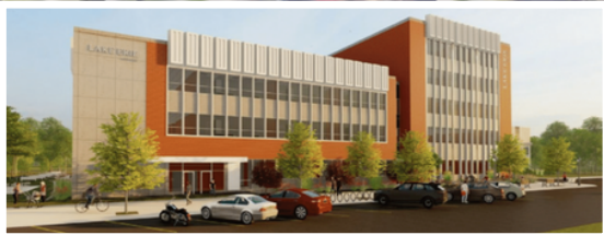
THE TOWER - LEC STUDENT HOUSING