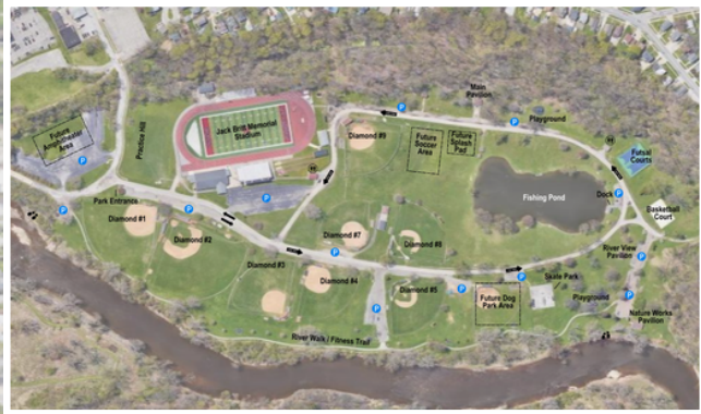
KIWANIS RECREATIONAL PARK