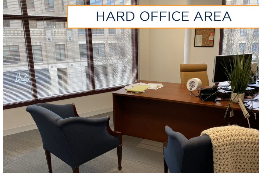
HARD OFFICE AREA