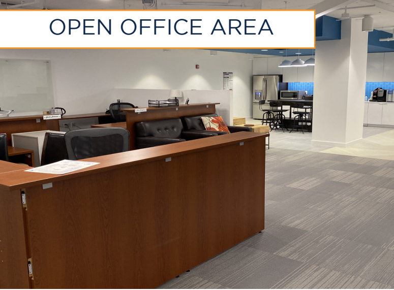
OPEN OFFICE AREA