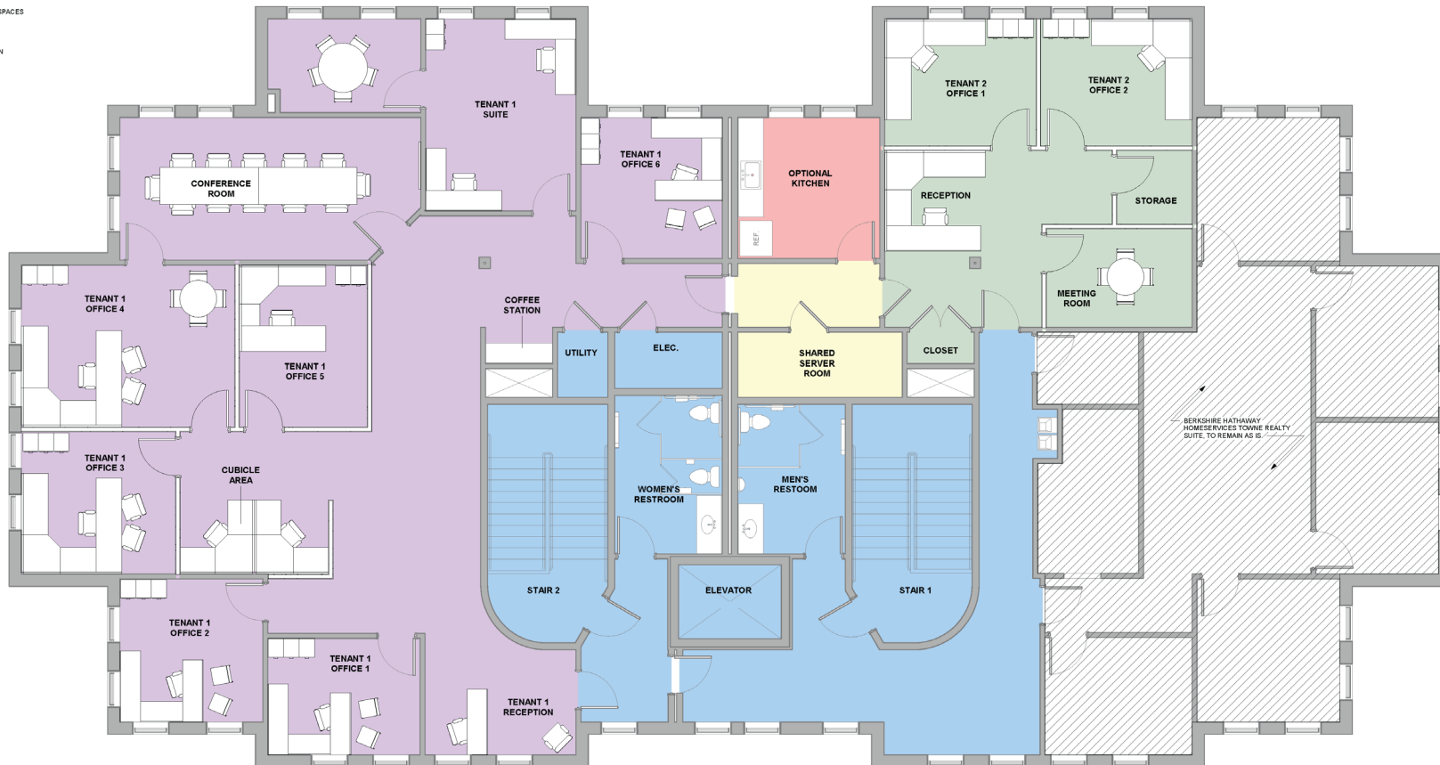
SECOND FLOOR PLAN - OPTION 2