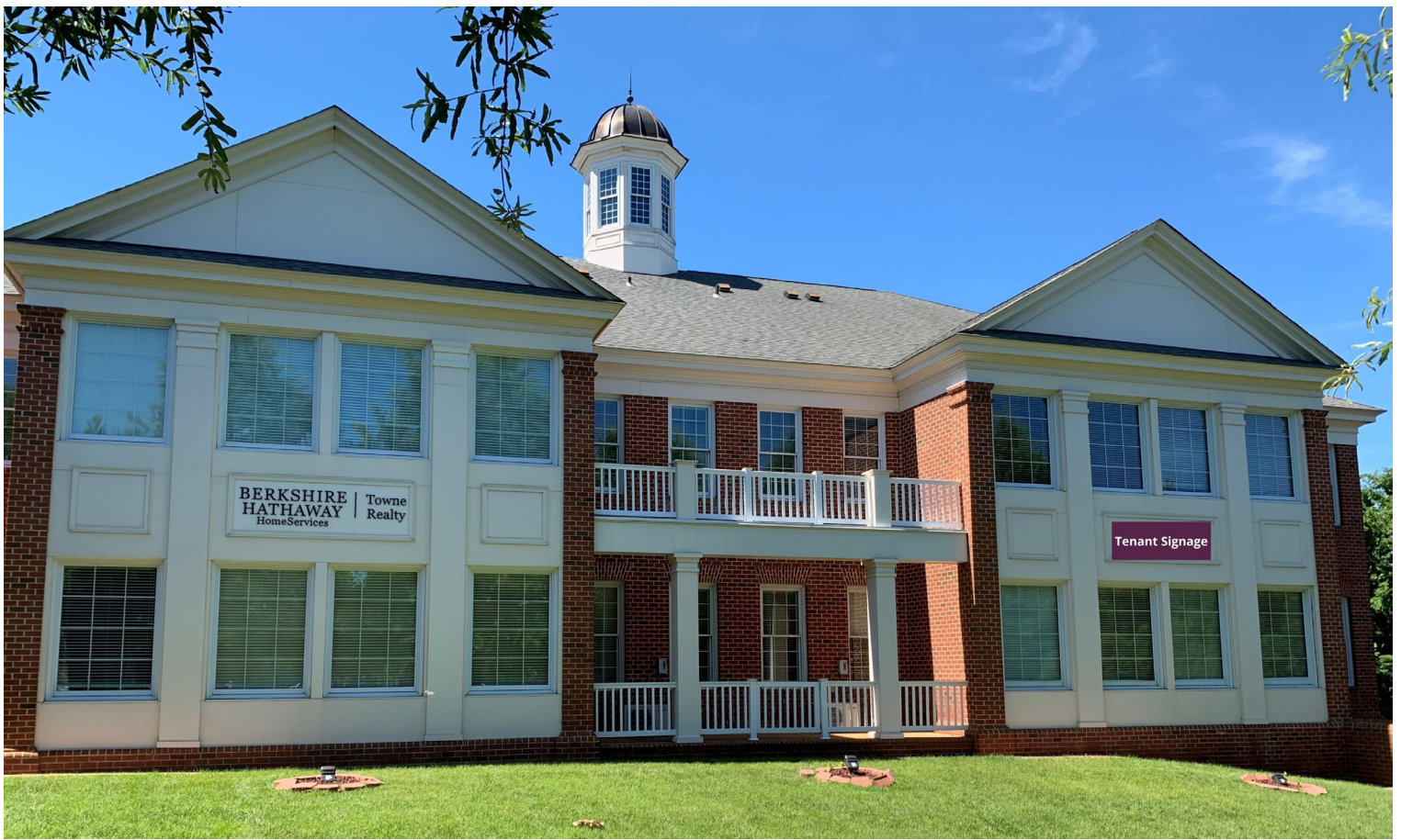
Monticello Street View