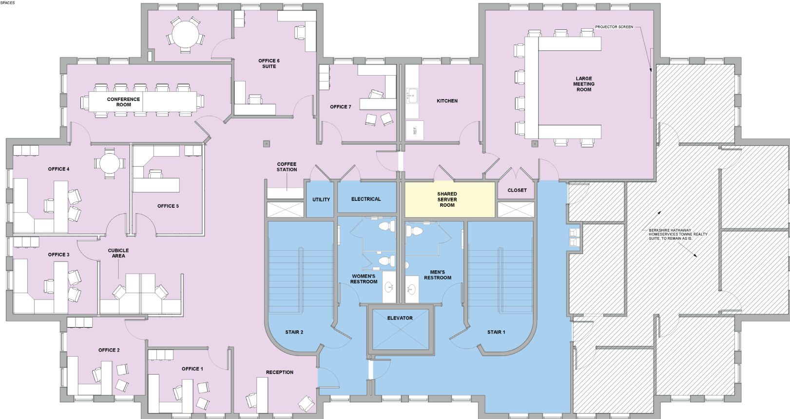
SECOND FLOOR PLAN - OPTION 1