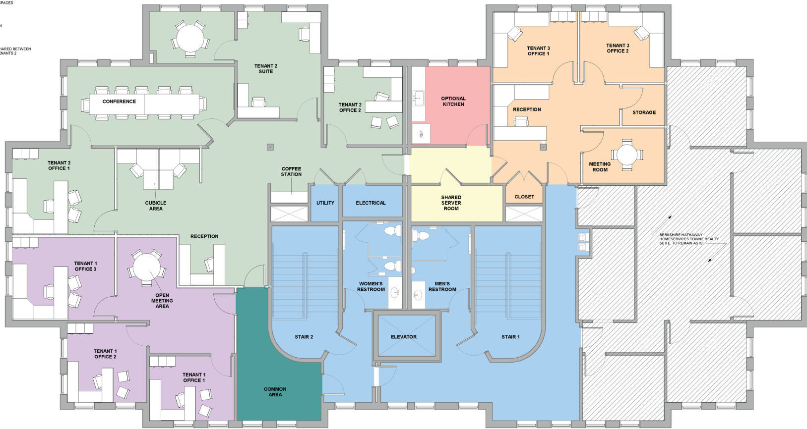
SECOND FLOOR PLAN - OPTION 3 1/4" = 1'-0"