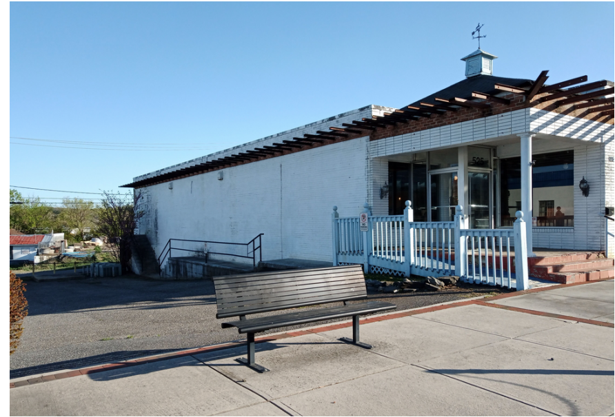
Main Entrance/Side Parking Lot