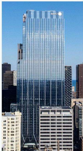
BMO Tower, Chicago

Headquartered in Chicago, BMO Harris Bank Founded 1882, 141 years ago is one of the largest banks in the Midwest serving more than 2 million customers. BMO boasts a market capitalization of $55.1 billion (10/31/2016) and $77.5 billion in deposits. The Company provides a broad range of personal banking products and solutions through over 800 branches and more than 1,400 ATMs in Illinois, Wisconsin, Indiana, Kansas, Missouri, Minnesota, Florida, Arizona and California.