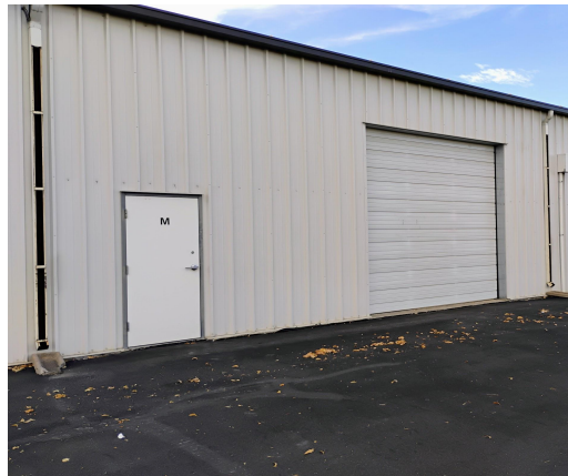
1822 Skyway Drive

Summit Commercial Brokers 6800 N 79th St, # 103 Niwot, CO 80503 303.931.7341 summitcommercial.net