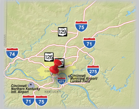
CBD Office Submarket