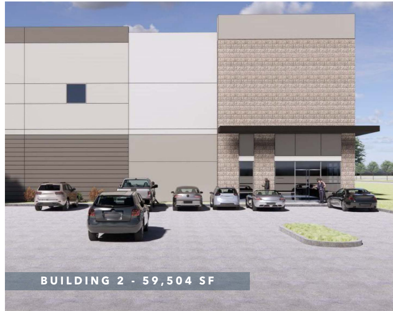
BUILDING 2 - 59,504 SF