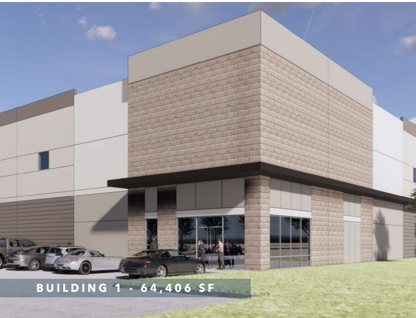
BUILDING 1 - 64,406 SF