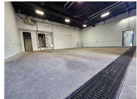
Each Office Is Independently Owned And Operated