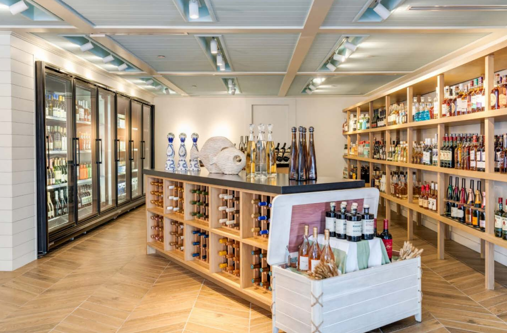
South Seas Spirits