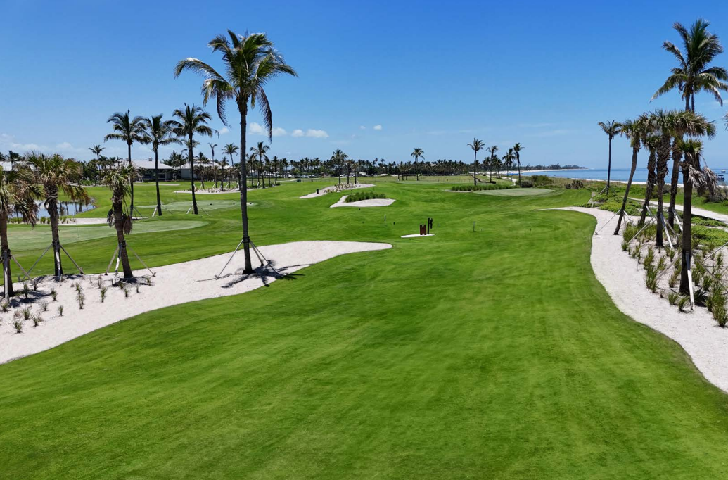
The Clutch Golf Course