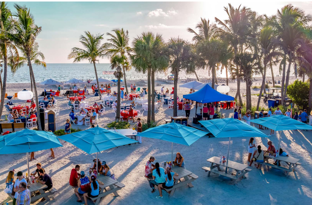
Sunset Beach 4th of July Celebration