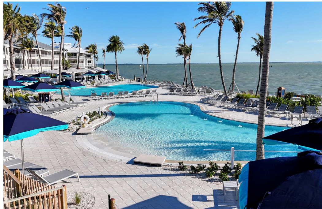
Bayview Pool Complex