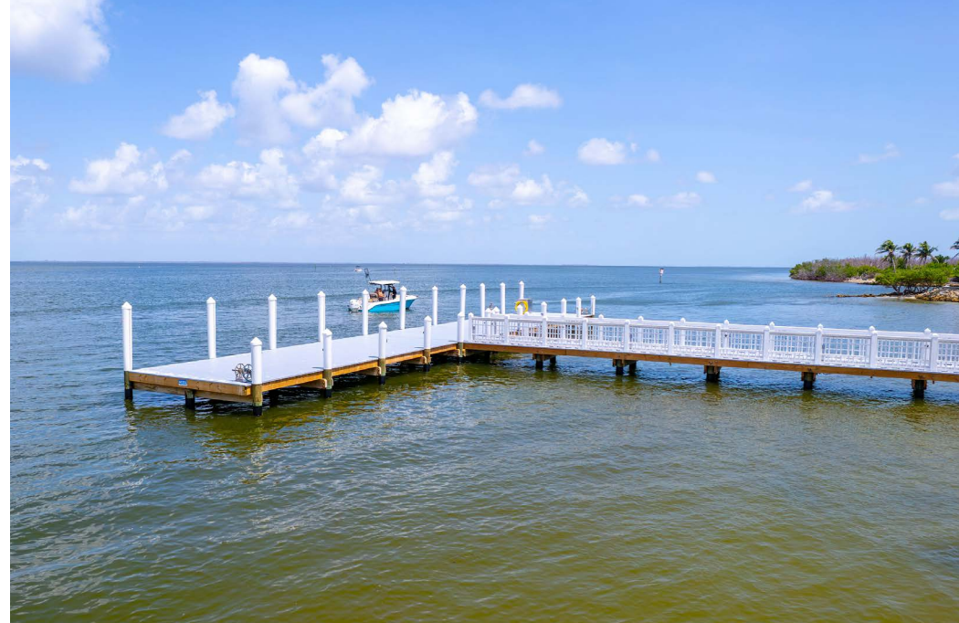
Bayview Fishing Pier