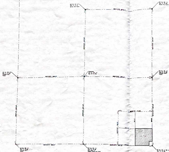
Section Detail Sec. 21-16-5F (Not to Scale)