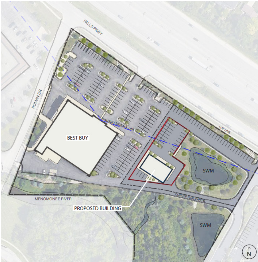
BEST BUY OUT-LOT PARCEL: