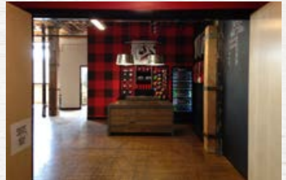
1st Floor - Finished Space