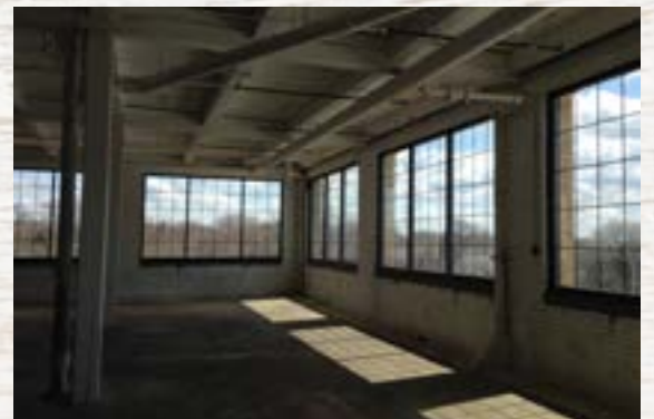
3rd Floor - Unfinished Space