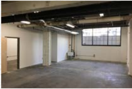
Garden Level - Finished Space