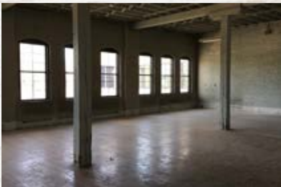
3rd Floor - Unfinished Space