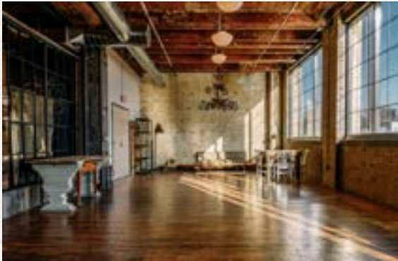
1st Floor - Finished Space