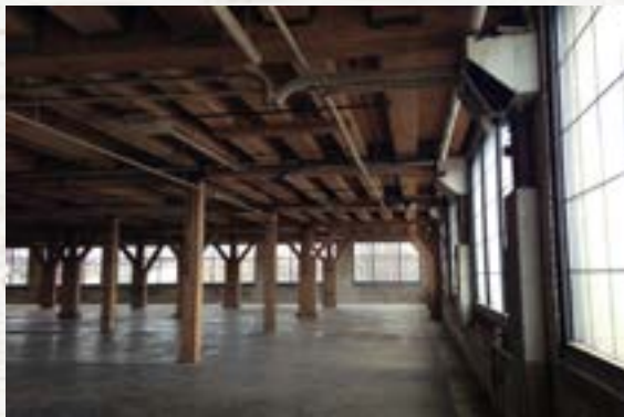
2nd Floor - Unfinished Space