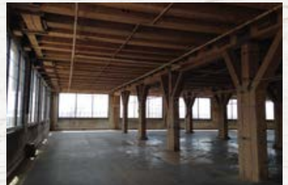
2nd Floor - Unfinished Space