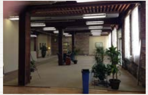
1st Floor - Media/Conference Center