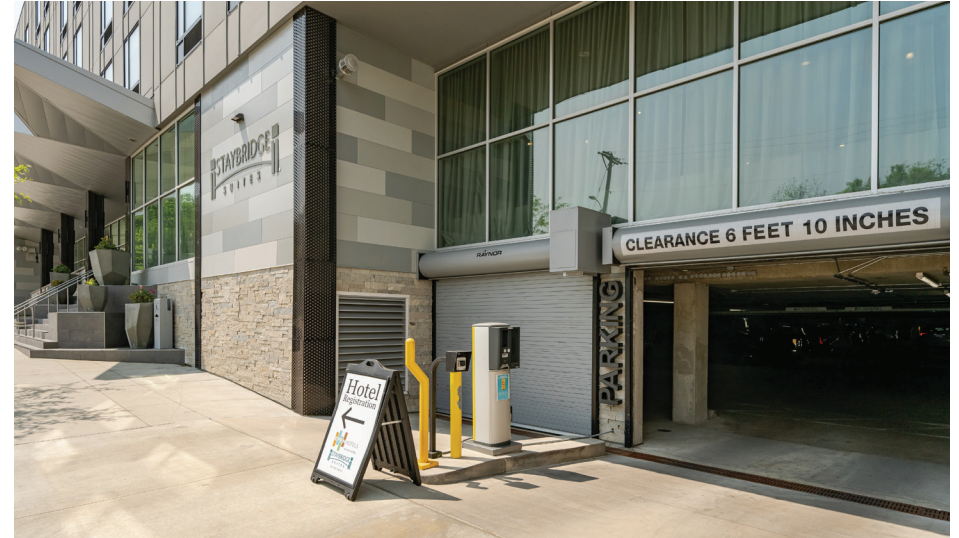
Ample heated underground parking available.