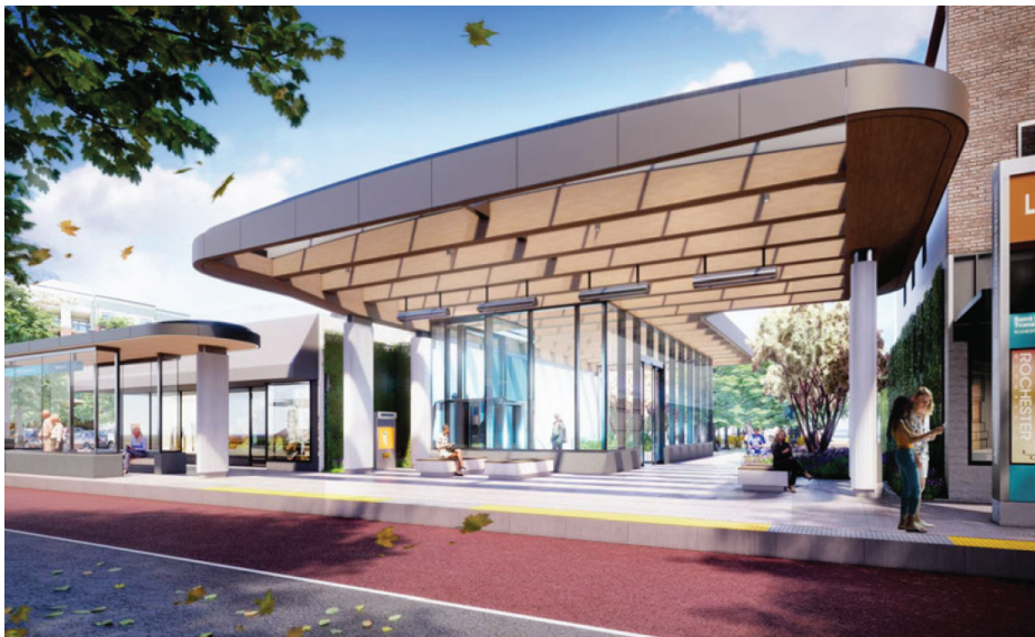
Close proximity to the St. Mary's stop of Link Rapid Transfer