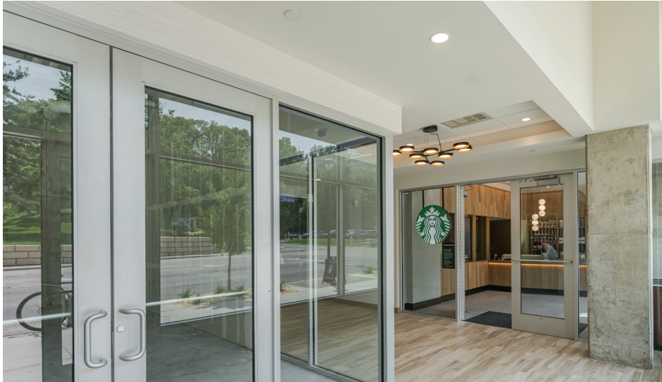
Corner Starbucks location just opened.