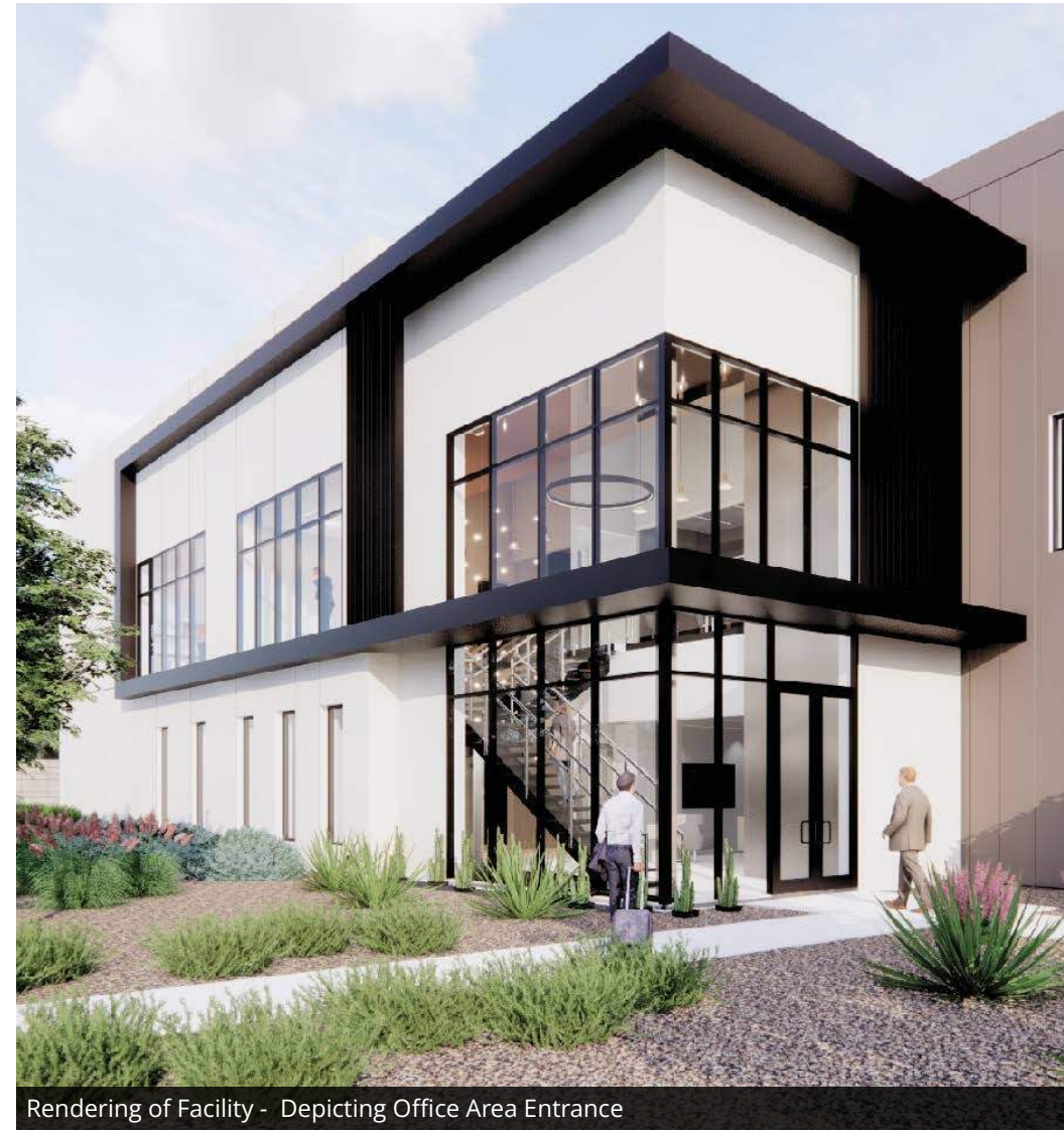
Rendering of Facility - Depicting Office Area Entrance