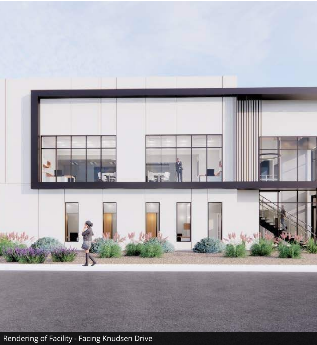
Rendering of Facility - Facing Knudsen Drive