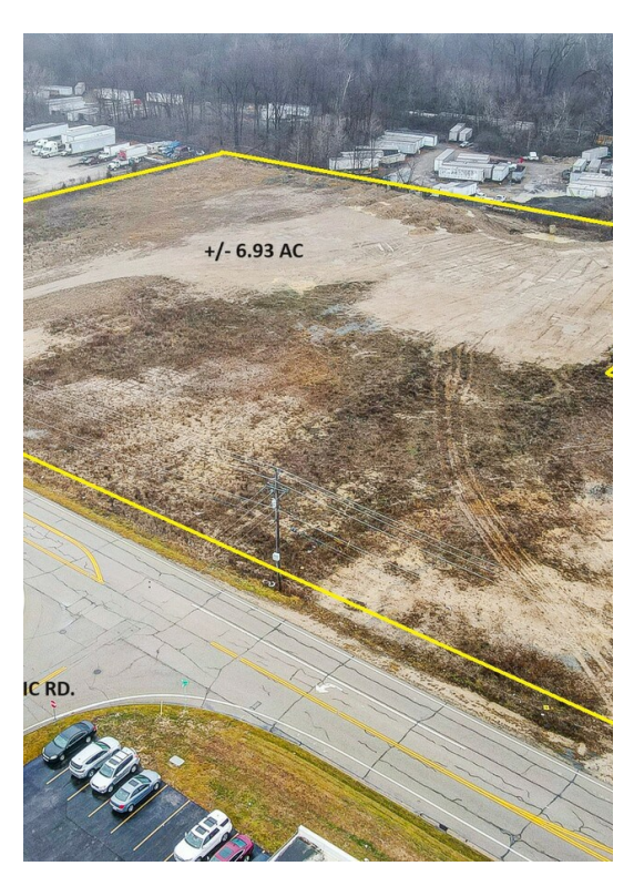
5900 Webster St 5900 Webster St, Dayton, OH 45414