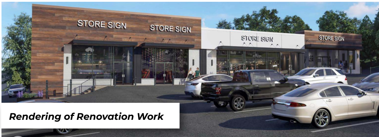
Rendering of Renovation Work