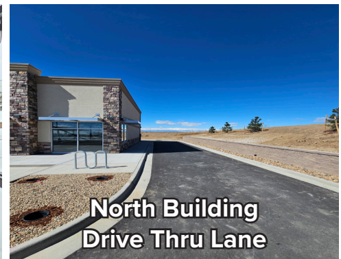
North Building Drive Thru Lane

Wheeler Properties, Inc. 1130 38th Avenue, Suite B Greeley, CO 80634 Office: 970-352-5860