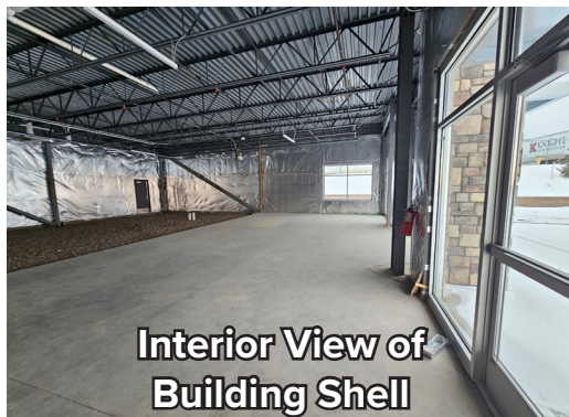
Interior View of Building Shell