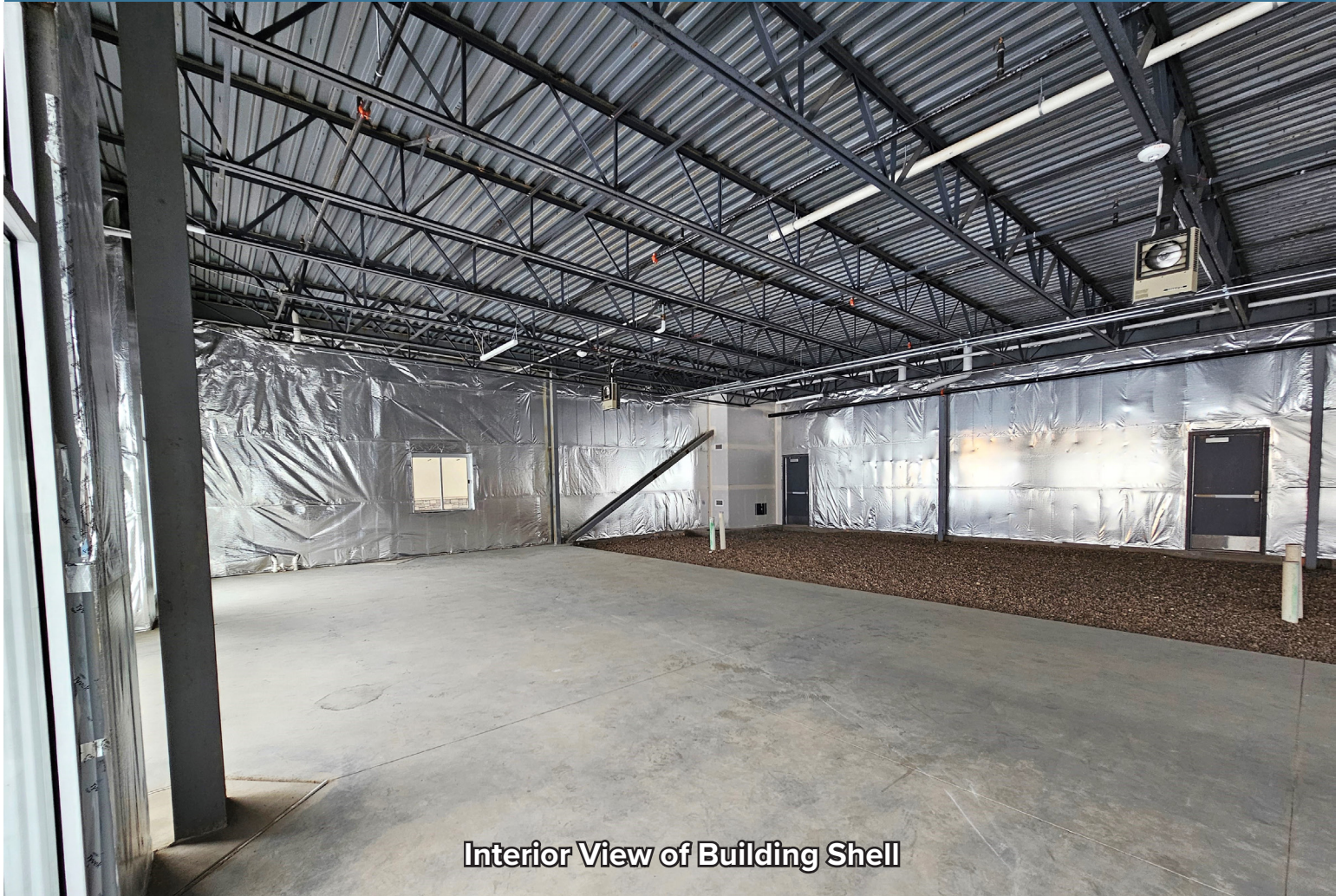
Interior View of Building Shell