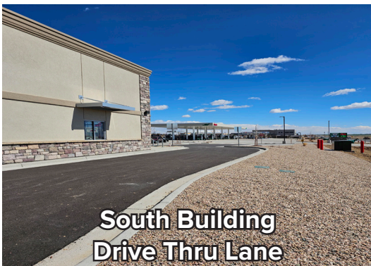
South Building Drive Thru Lane