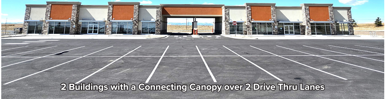
2 Buildings with a Connecting Canopy over 2 Drive Thru Lanes