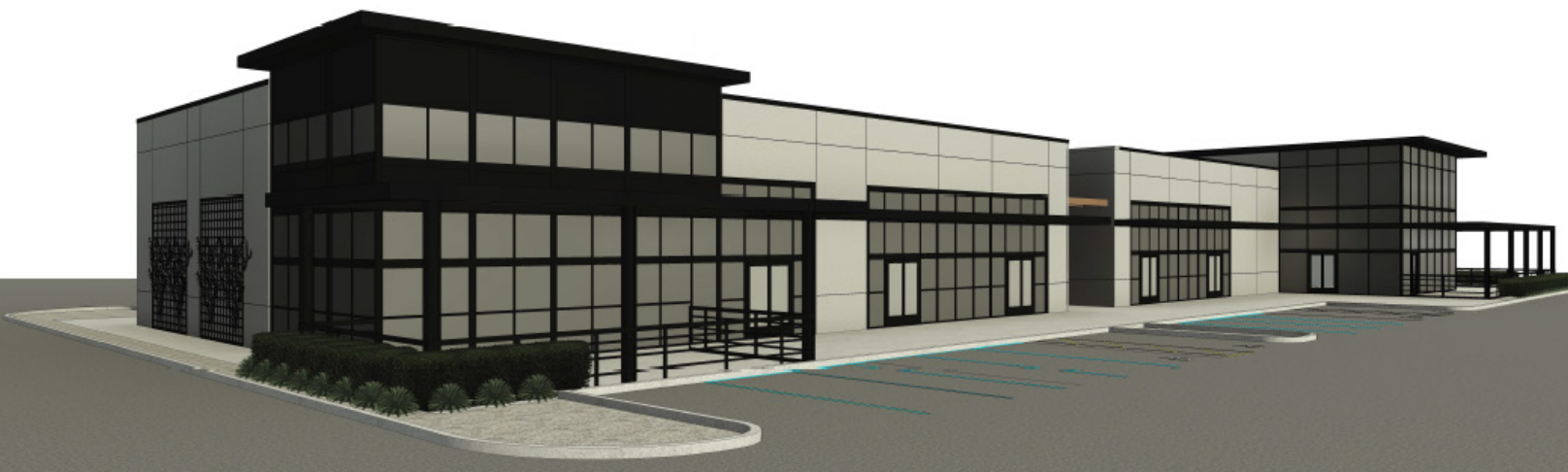
① PAD 6 FRONTAGE VIEW