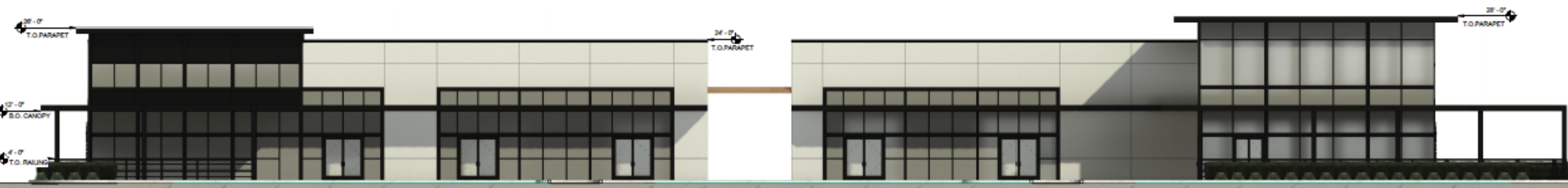
② PAD 6 SOUTH ELEVATION 1/8" = 1'-0"

The information contained herein has been obtained from sources believed reliable. While we do not doubt its accuracy, we have not verified it and make no guarantee, warranty or representation about it. It is your responsibility to independently confirm its accuracy and completeness. Any projections, opinions, assumptions or estimates used for example only, and do not represent the current or future performance of the property. The value of this transaction to you depends on tax and other factors which should be evaluated by your tax, financial & legal advisors. You and your advisors should conduct a careful, independent investigation of the property to determine, to your satisfaction, the suitability of the property for your needs.