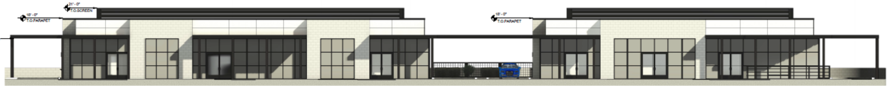
① PAD 2B- East Elevation 1/8" = 1'-0"

± 17 ACRES | MIXED-USE DEVELOPMENT | NEC ELLSWORTH ROAD AND ELLIOT ROAD | MESA, ARIZONA