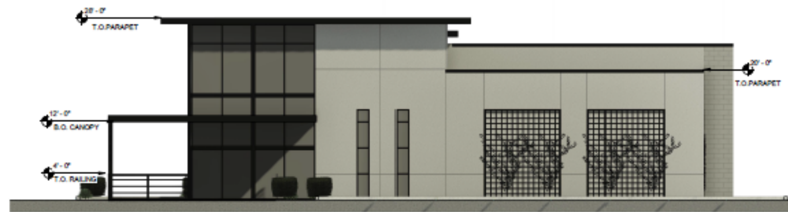
① PAD 6 EAST ELEVATION 1/8" = 1'-0"