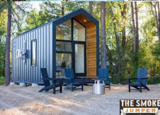
THE SMOKE JUMPER

Boom town! When gold was discovered in 1862, Idaho City was built nearly instantly. Originally known as Bannock, Idaho City became one of the largest cities in the Pacific Northwest. It's population quickly swelled to approximately 7,000 with an estimated 25,000 individuals residing nearby. What remained of Idaho City's historic downtown has been preserved over the years. Some buildings date back to the 1860's. While many of the buildings are now newer, Idaho City maintains its historic look downtown. Visiting Idaho City is an amazing look back into the history of Idaho itself. Idaho City Historical Foundation is proud to work to preserve the properties it cares for, for the enjoyment of anyone interested in this history. Idaho City is a great town to explore, with many unique shops and great restaurants.