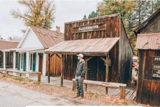
City of Idaho City

Multi Tenant Retail Building | Idaho City, ID FOR SALE $770,000 | ±2,800 SF