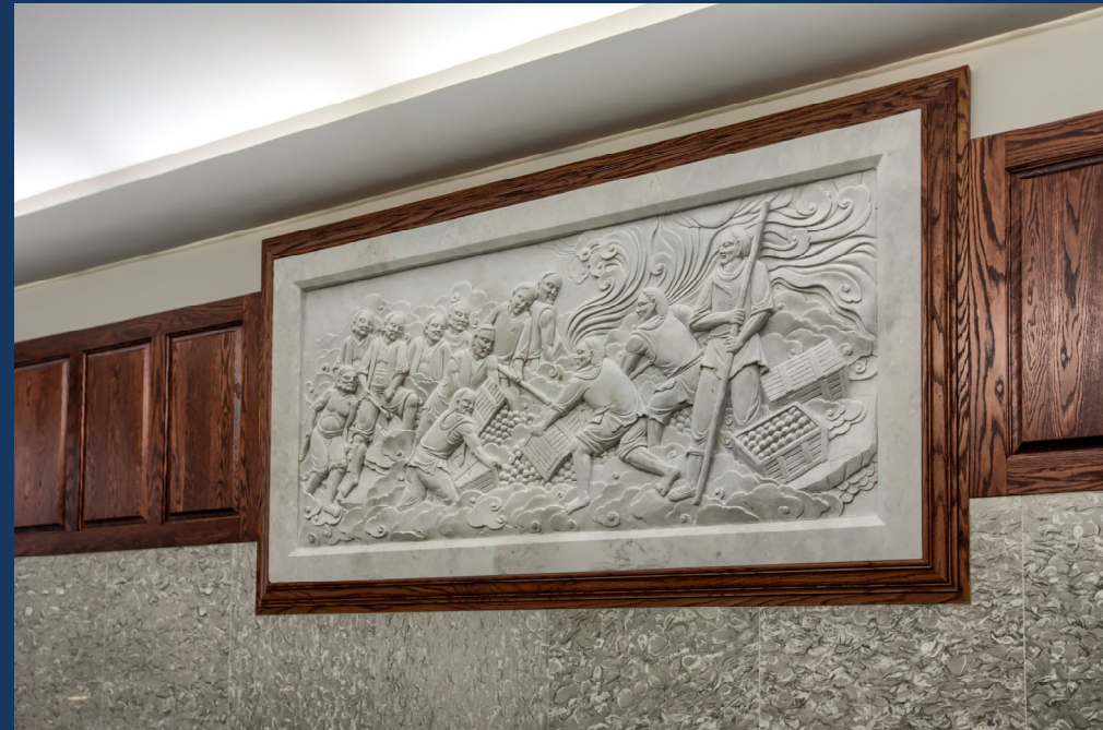
2ND LEVEL GALLERY