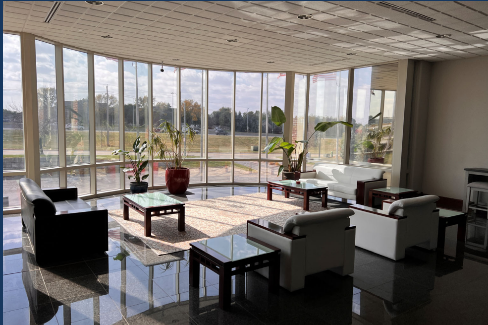
TENANT LOUNGE AREA