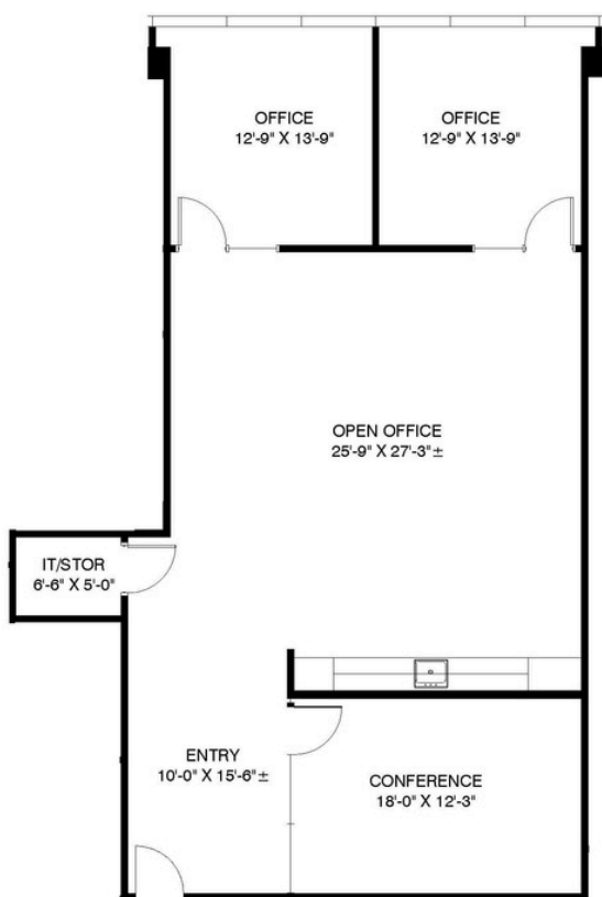
SPEC SUITE 305 1,800 RSF