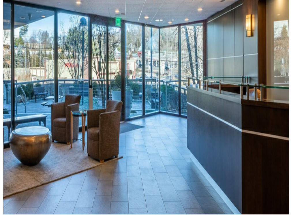
Elegantly Updated Lobby