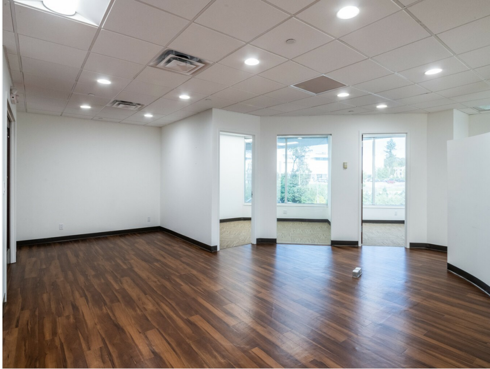
Luxury Office Suites