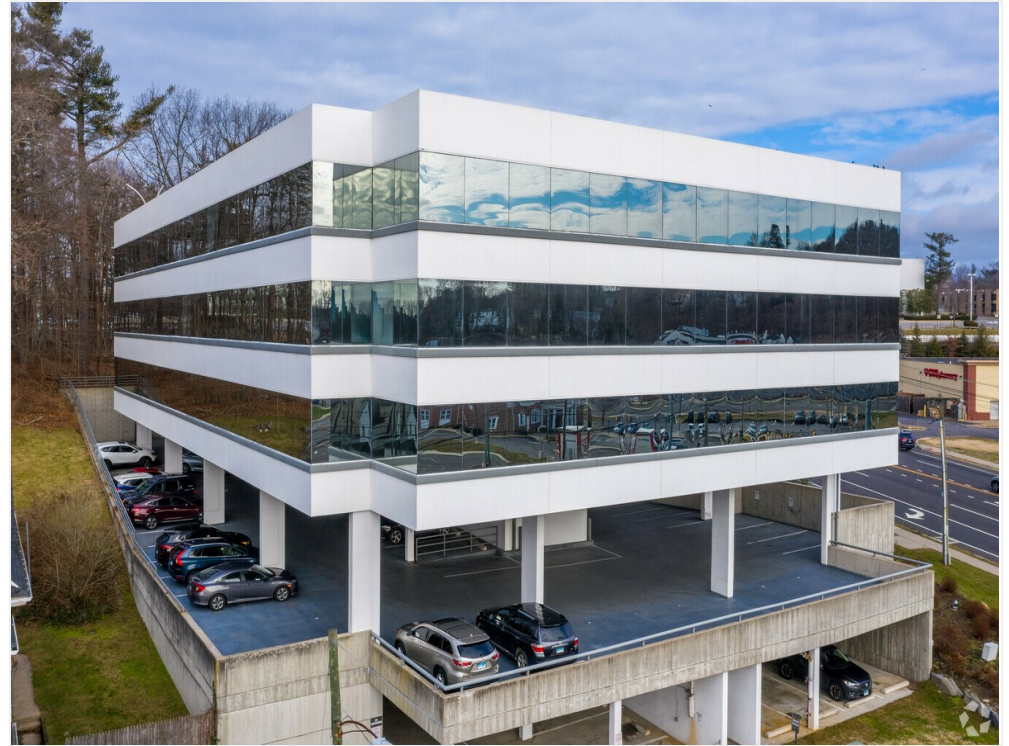
Dual Level Parking Garage Under Building