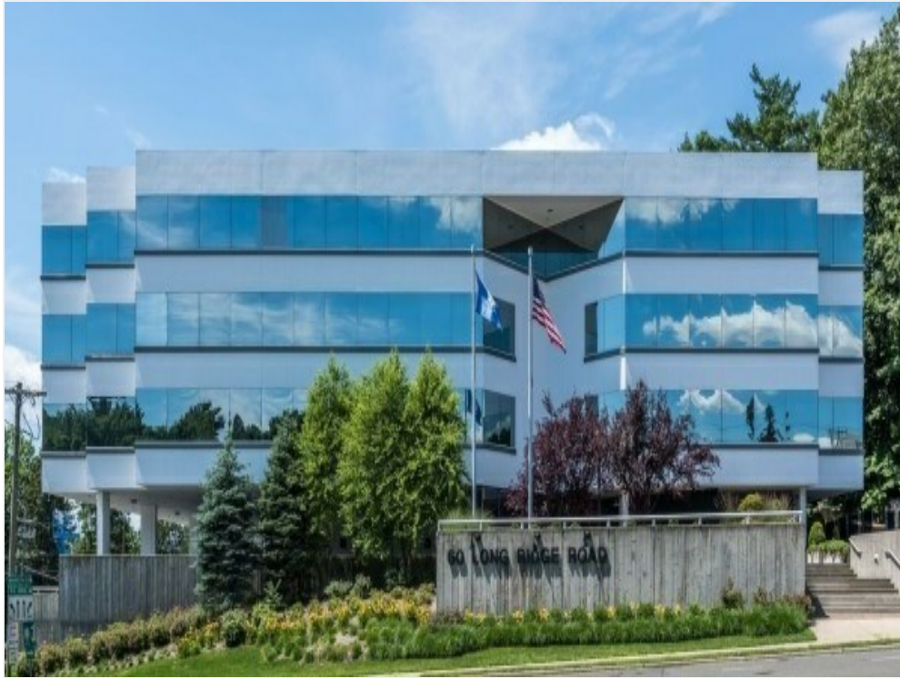
State-of-the-Art Office Building