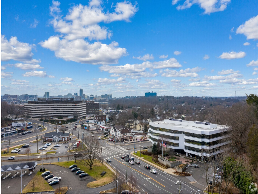
Located at a Signalized Intersection