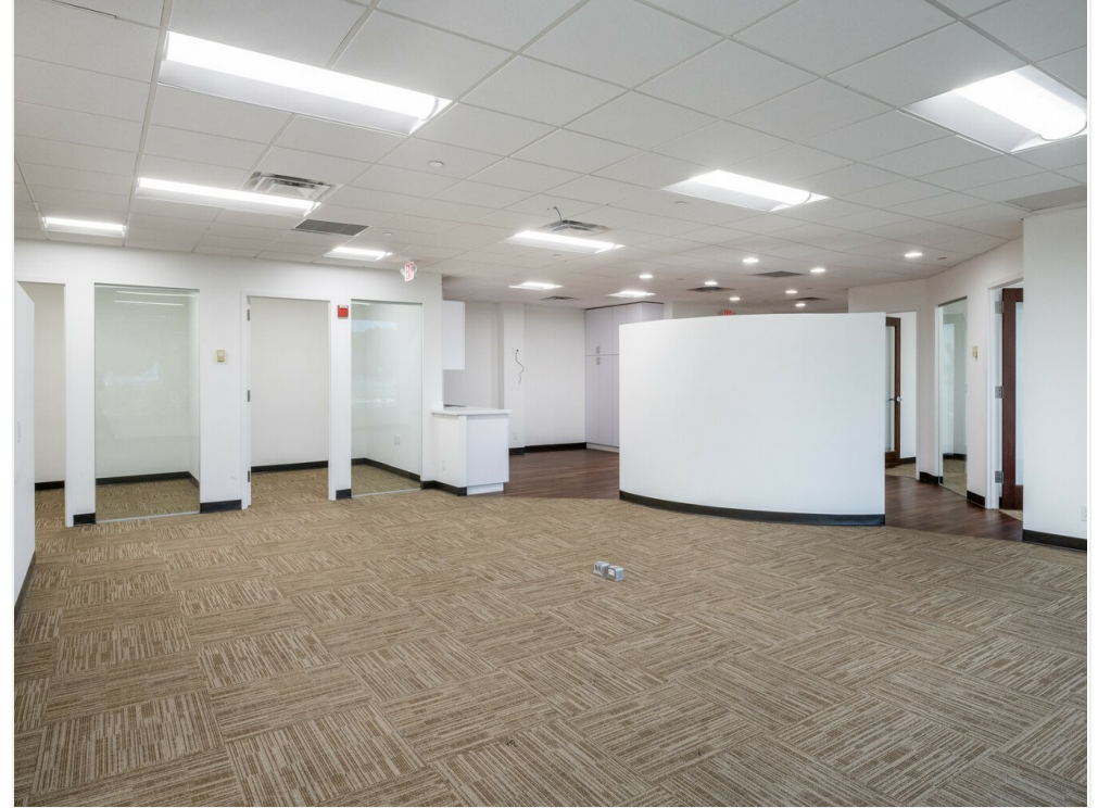
Luxury Office Suites