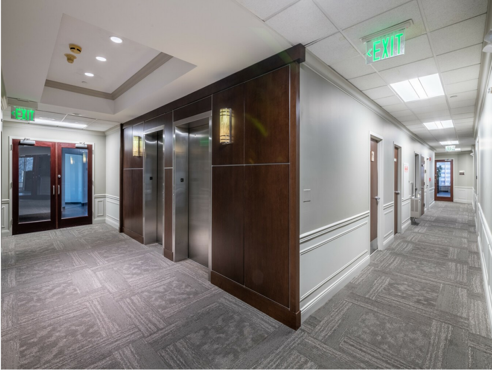
Elevator Bank and Office Corridor