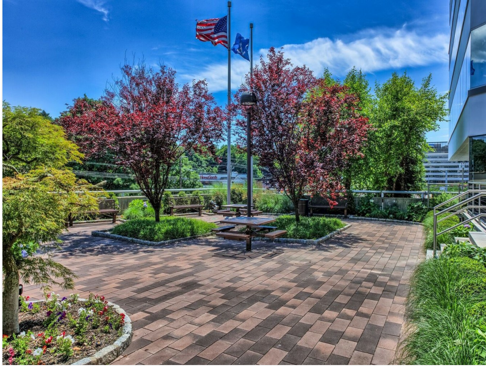
Lush Landscaped Patio Entrance