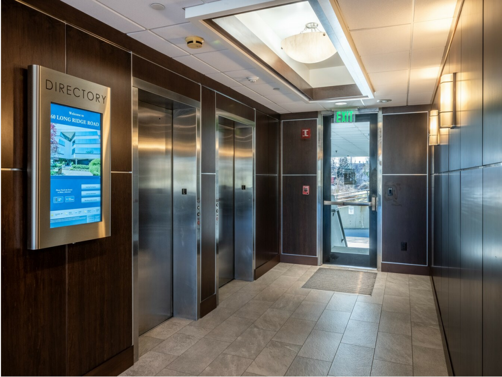
Rear Entrance with Elevator Bank