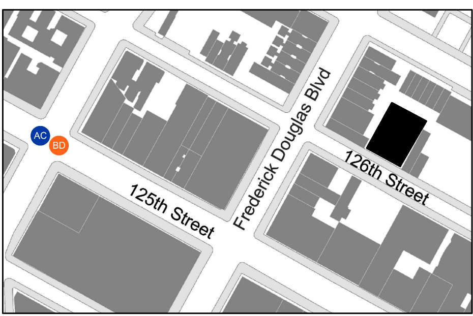
VICINITY PLAN N SCALE : OUT OF SCALE