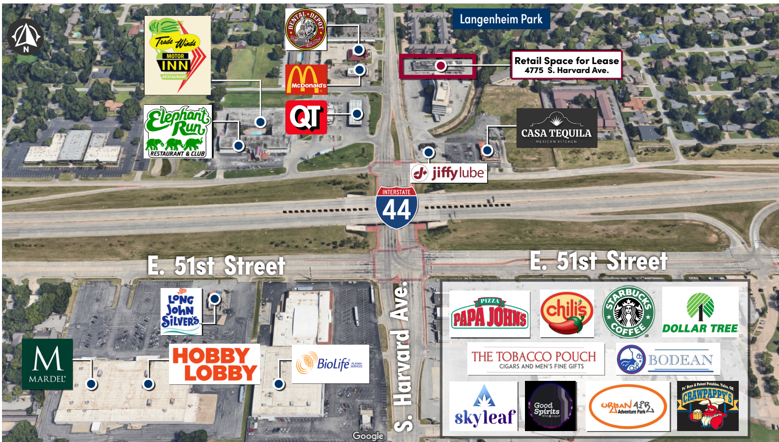
Greater Tulsa Area Map