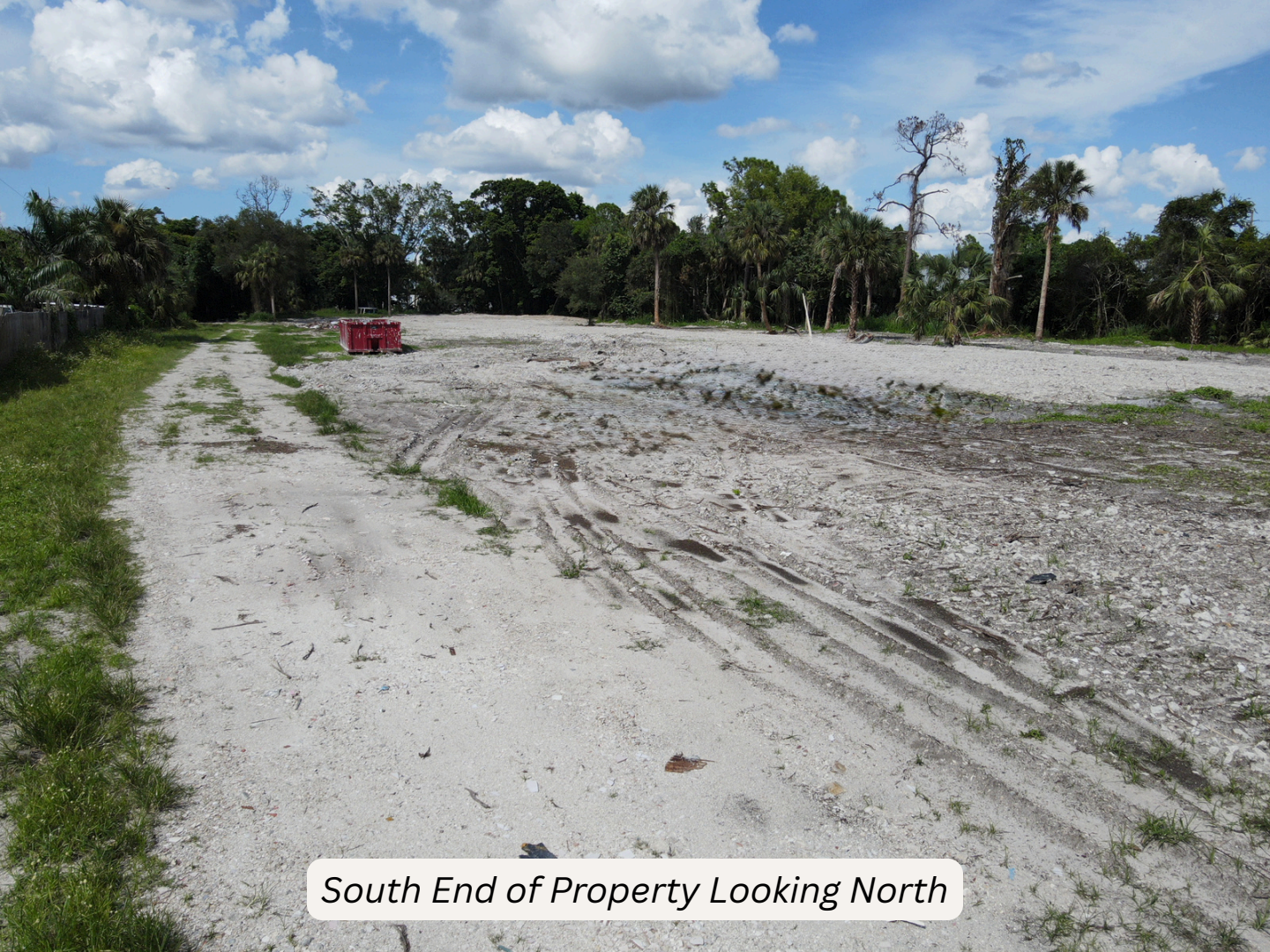
South End of Property Looking North