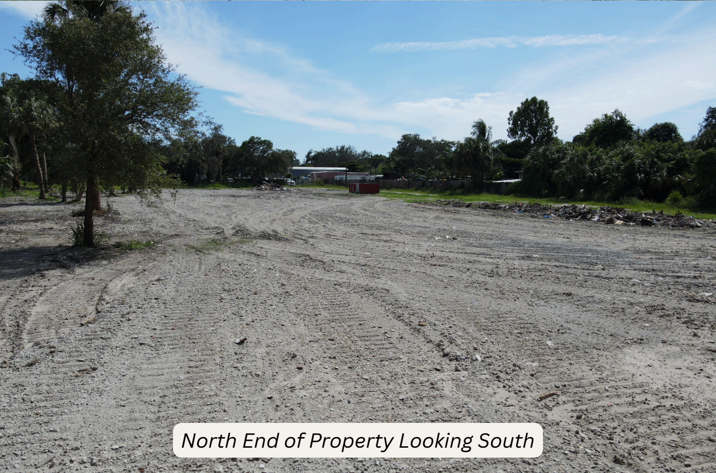
North End of Property Looking South