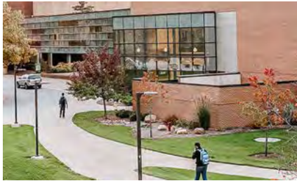
Purdue Fort Wayne

#1 Hottest Housing Market (Wallstreet Journal, 2024)