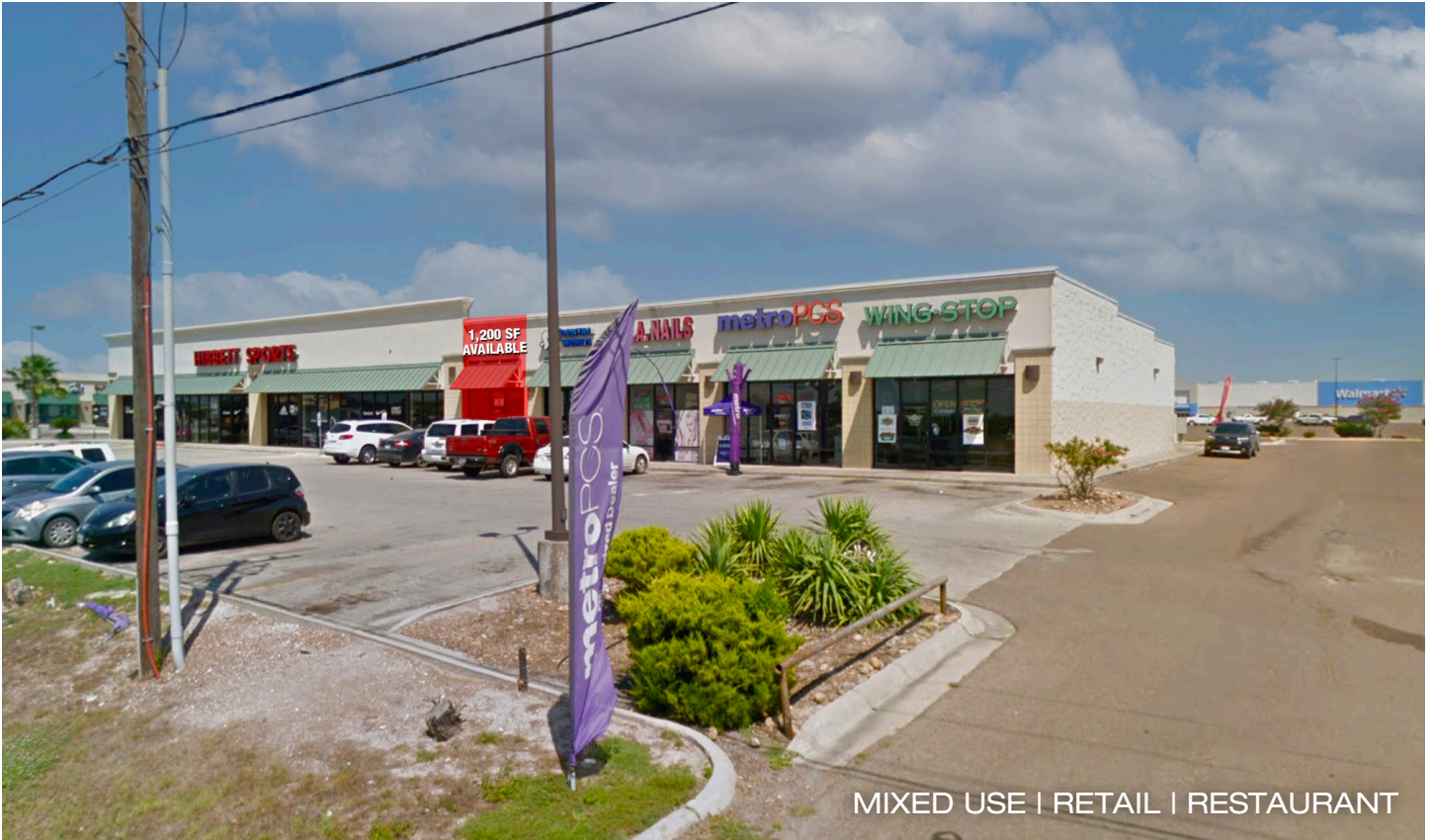
MIXED USE | RETAIL | RESTAURANT

CENTER SIZE: 15,964 SF AVAILABILITY: SEE PAGE 3 NNN: PLEASE CALL RATES: PLEASE CALL