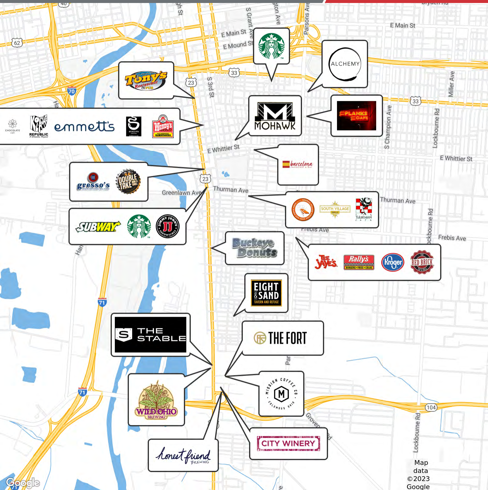
Map data © 2023 Google