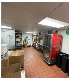
FULLY APPROVED IMMACULATE BASEMENT