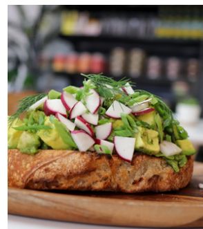
PROFITABLE AND PROVEN MULTI-UNIT TENANT

WELL CAPITALIZED COMMERCIAL CONDO COMPLEX WITH STRONG OCCUPANCY AND NUMEROUS AREA RESIDENTIAL AND RETAIL DEVELOPMENTS UNDERWAY