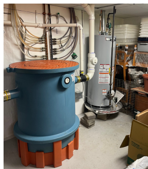
BEST IN CLASS INFRASTRUCTURE