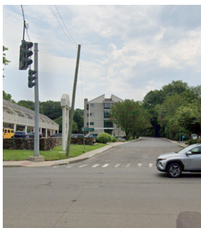
LIGHTED ENTRANCE AND EXIT