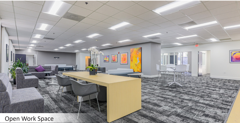
Open Work Space