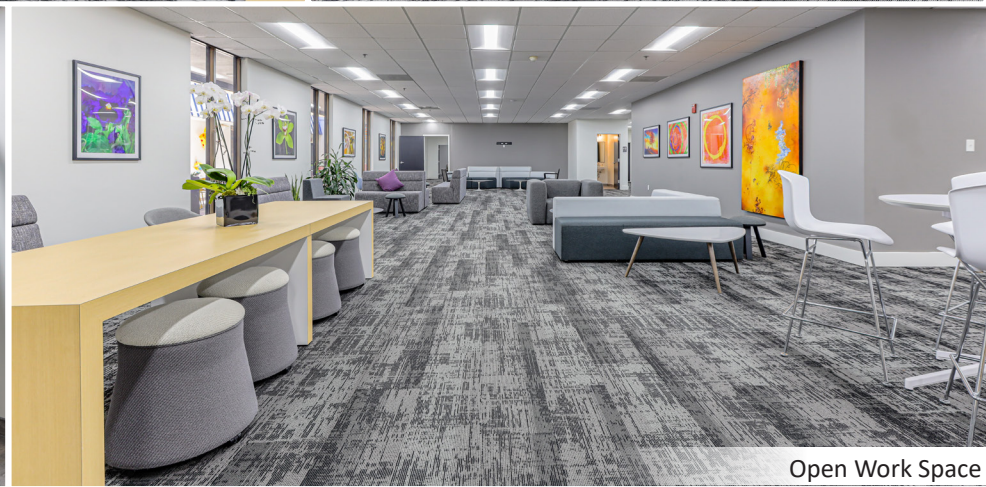
Open Work Space