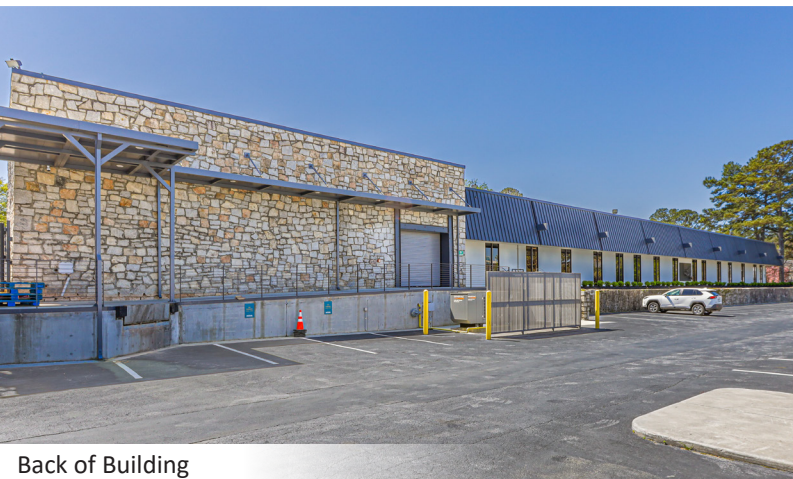
Back of Building