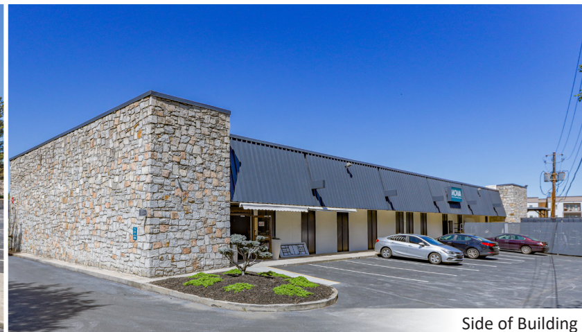
Side of Building