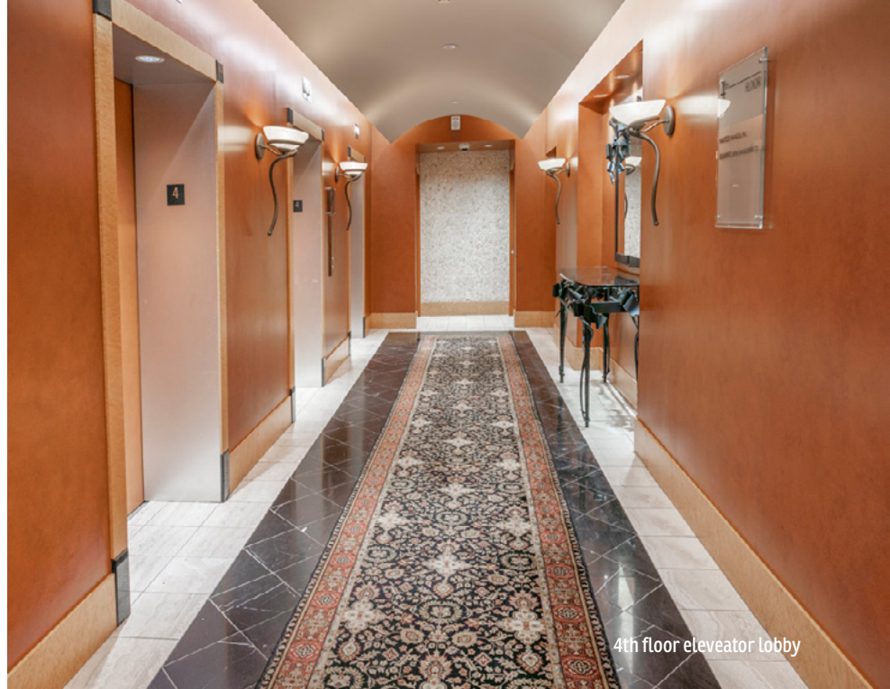
4th floor elevator lobby