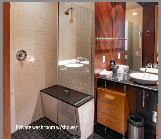
Private washroom w/shower.