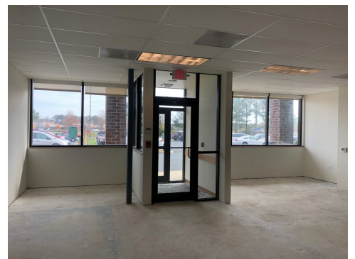
Suite 838 Storefront