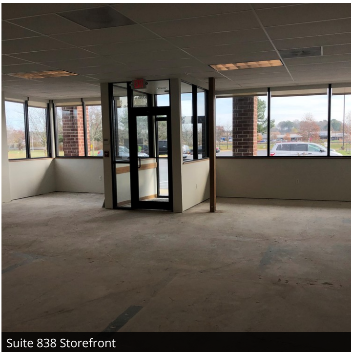
Suite 838 Storefront