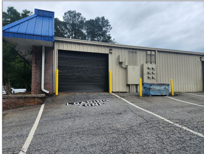
Exterior Drive-in Door at Rear

Interior photos are not representative of actual space