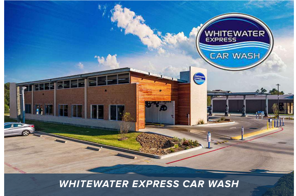
WHITEWATER EXPRESS CAR WASH

WhiteWater washes a large volume of cars daily but uses only half the amount of water as the industry standard. At 25-30 gallons per car, WhiteWater Express Car Wash consumes 70% less than other car washes using soft water, as well as eco-friendly and phosphate-free detergents, and all water is treated and disposed of according to state and local laws.