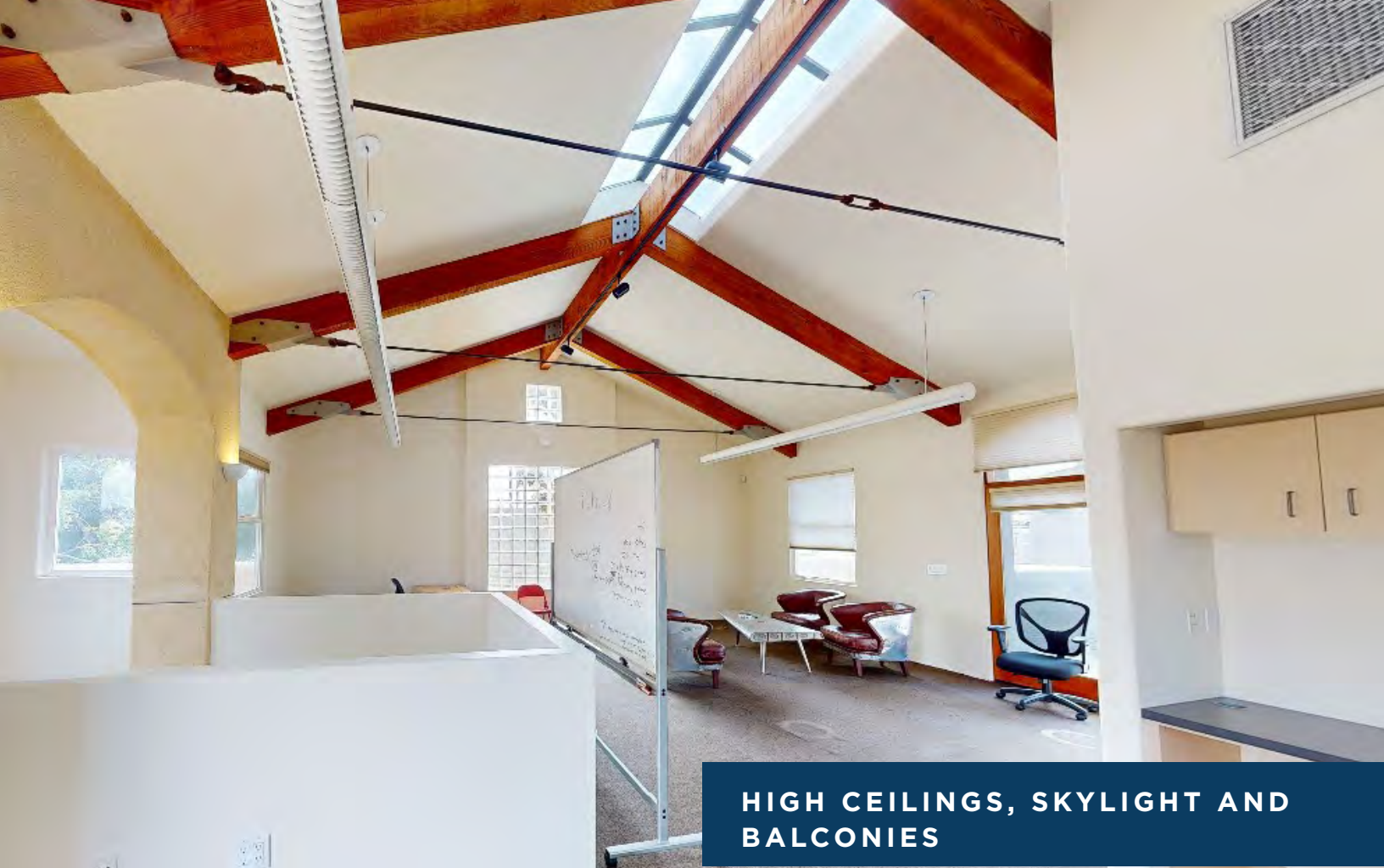
HIGH CEILINGS, SKYLIGHT AND BALCONIES