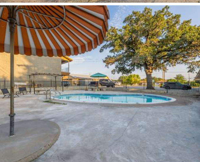
Outside and Pool Area