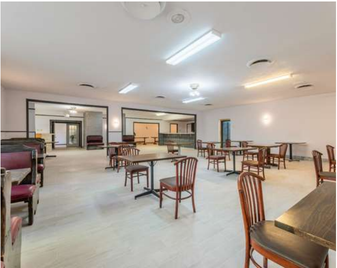
Lobby & Restaurant Space