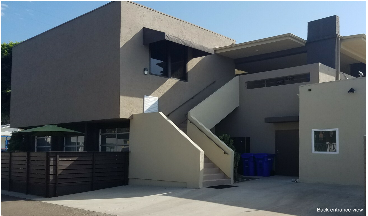
Back entrance view