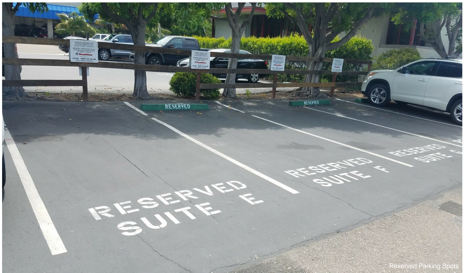
Reserved Parking Spots