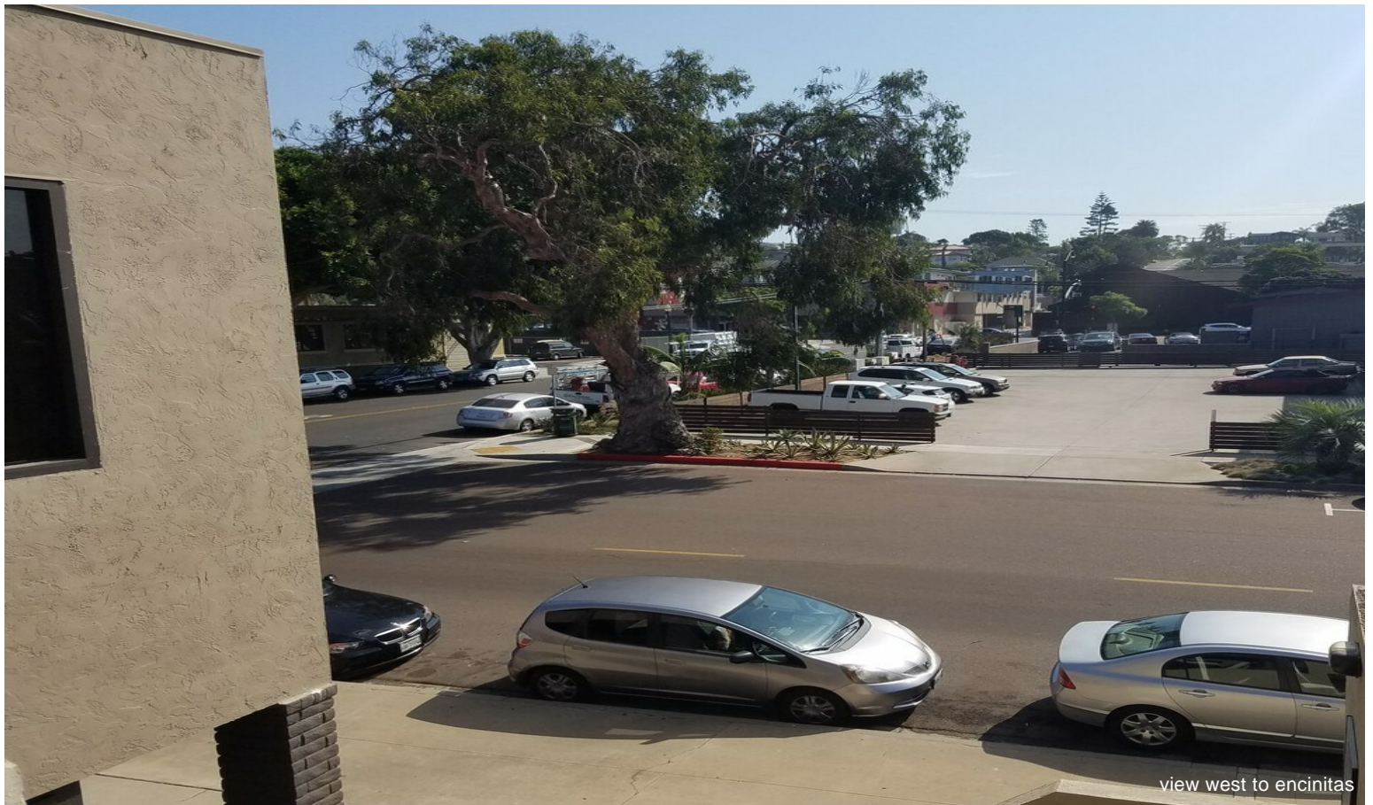
view west to encinitas