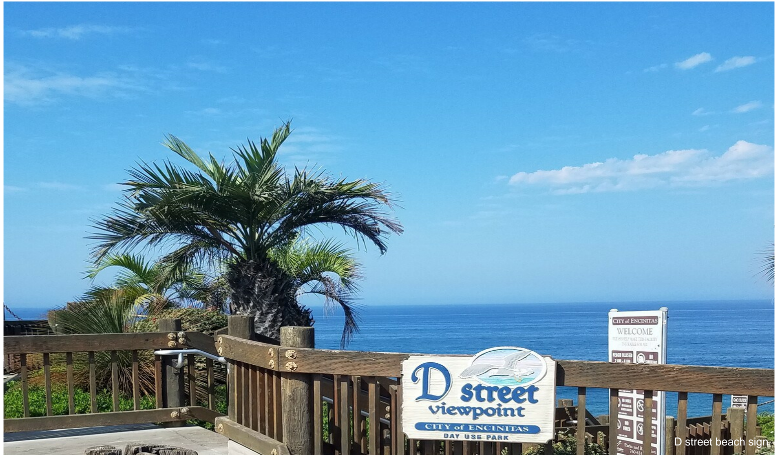
D street beach sign