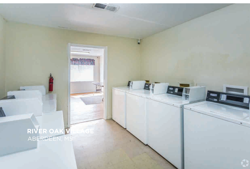
RIVER OAK VILLAGE ABERDEEN, MS