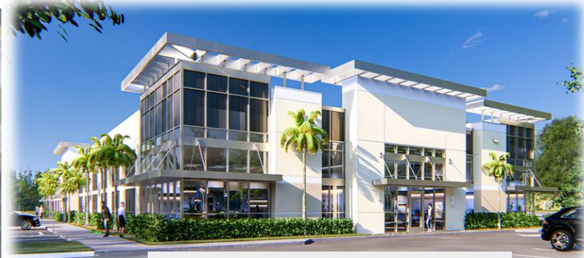
Prime Exposure- Northern Elevation