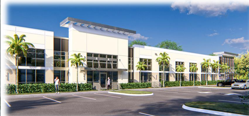
Ample Nature Light - Eastern Elevation