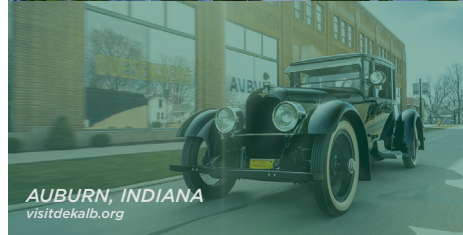
AUBURN, INDIANA visitdekalb.org

#13 Top States for Doing Business (CNBC, 2023)