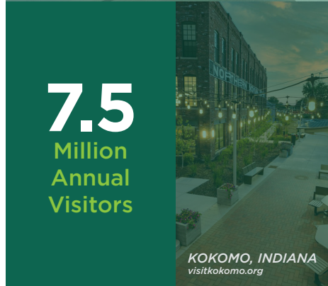
KOKOMO, INDIANA visitkokomo.org

#13 Top States for Doing Business (CNBC, 2023)