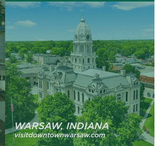
WARSAW, INDIANA visitdowntownwarsaw.com