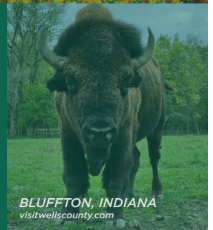
BLUFFTON, INDIANA visitwellscounty.com