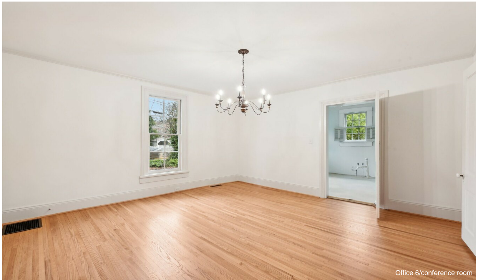
Office 6/conference room