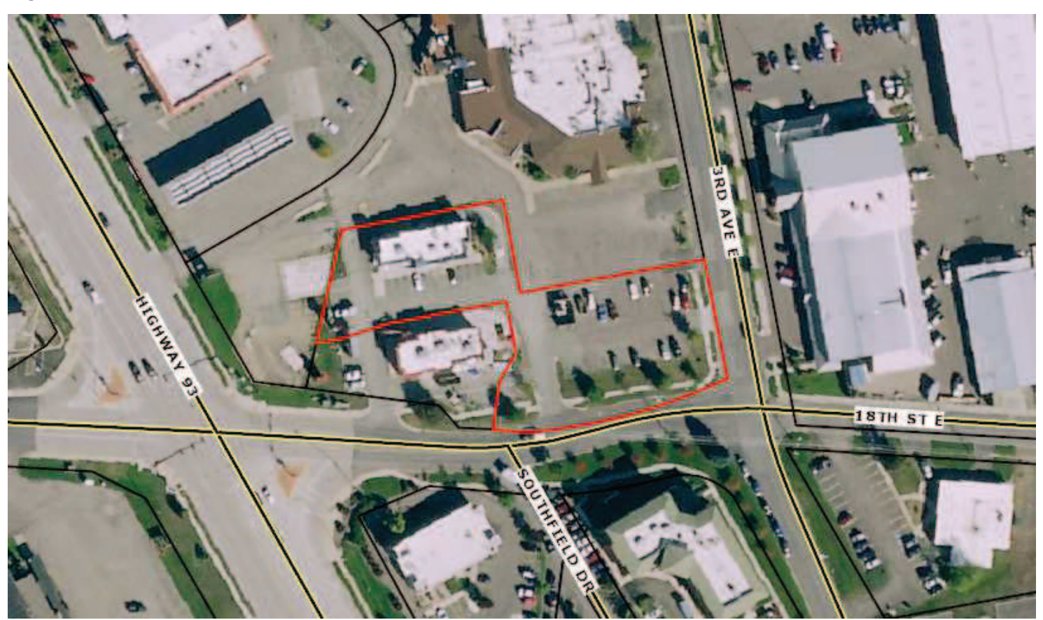
Sentry Dynamics, Inc. and its customers make no representations, warranties or conditions, express or implied, as to the accuracy or completeness of information contained in this report.

Legal SUBDIVISION 288, S17, T28 N, R21 W, Lot 1, ACRES 1.04, ASSR# 0000504004