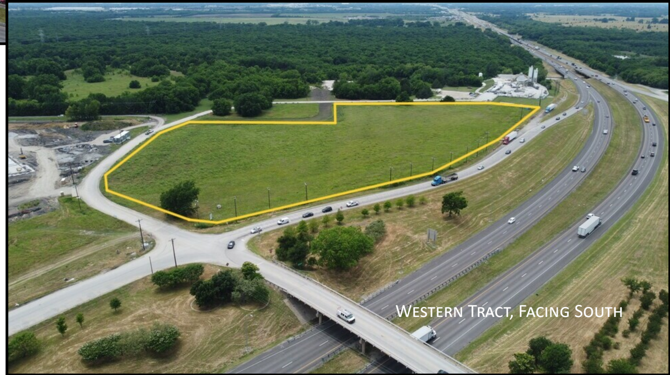
WESTERN TRACT, FACING SOUTH

This information has been secured from sources believed to be reliable, but no representations or warranties, expressed or implied, as to the accuracy of the information are being made. References to square footage or acreage are approximate. Buyer must verify the information and bears all risk for any inaccuracies. David Tuttle is acting as the seller's broker and is also a principal in the seller's ownership entity.