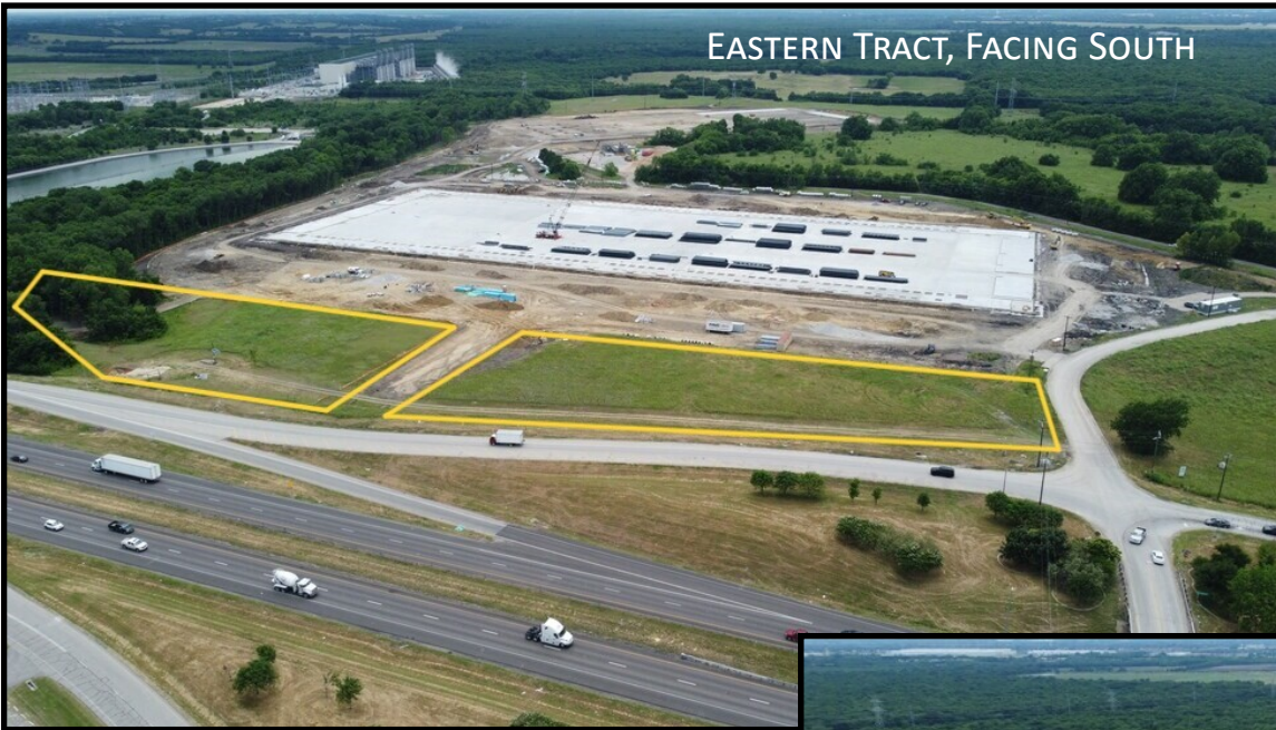
EASTERN TRACT, FACING SOUTH