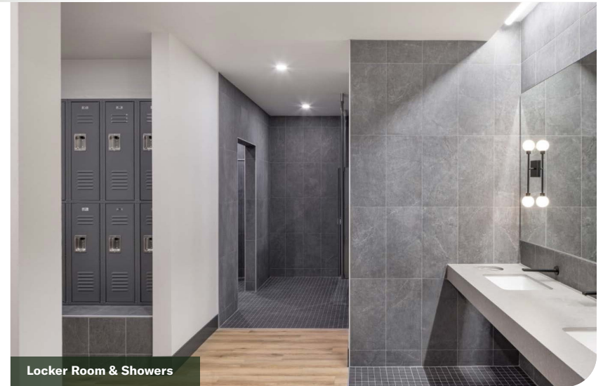
Locker Room & Showers