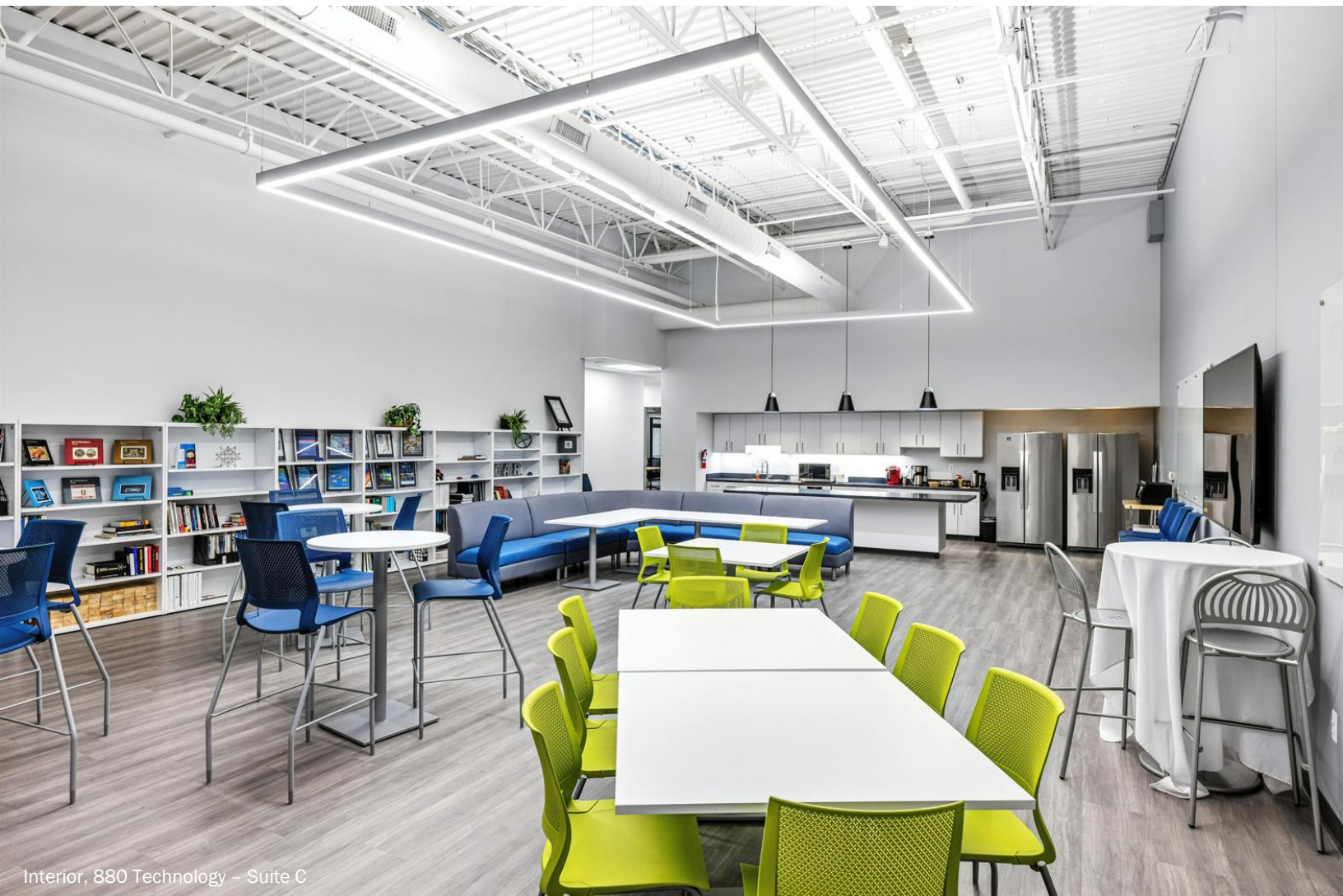
Interior, 880 Technology – Suite C