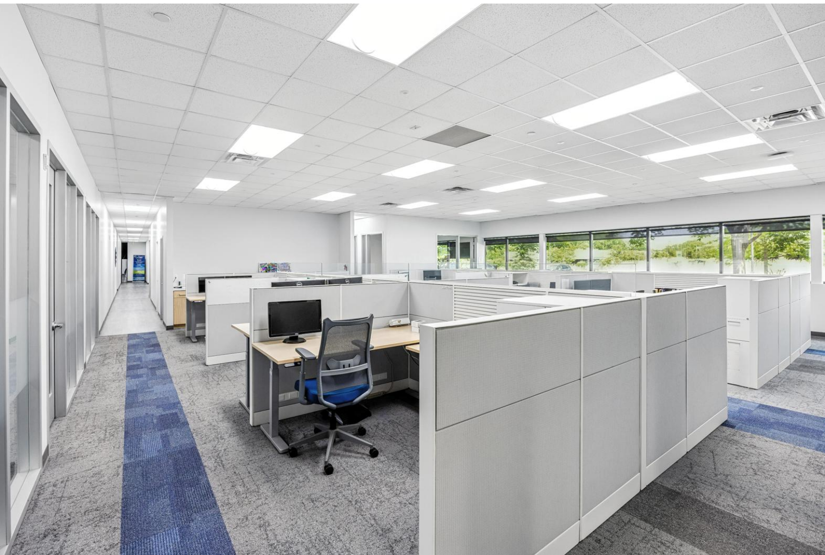
Interior, 880 Technology – Suite C