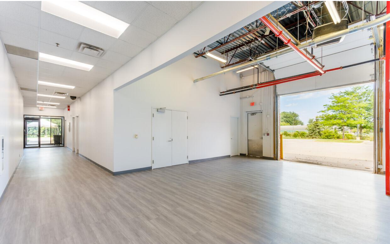
Amenity loading area with 10' x 10' garage door (expandable)