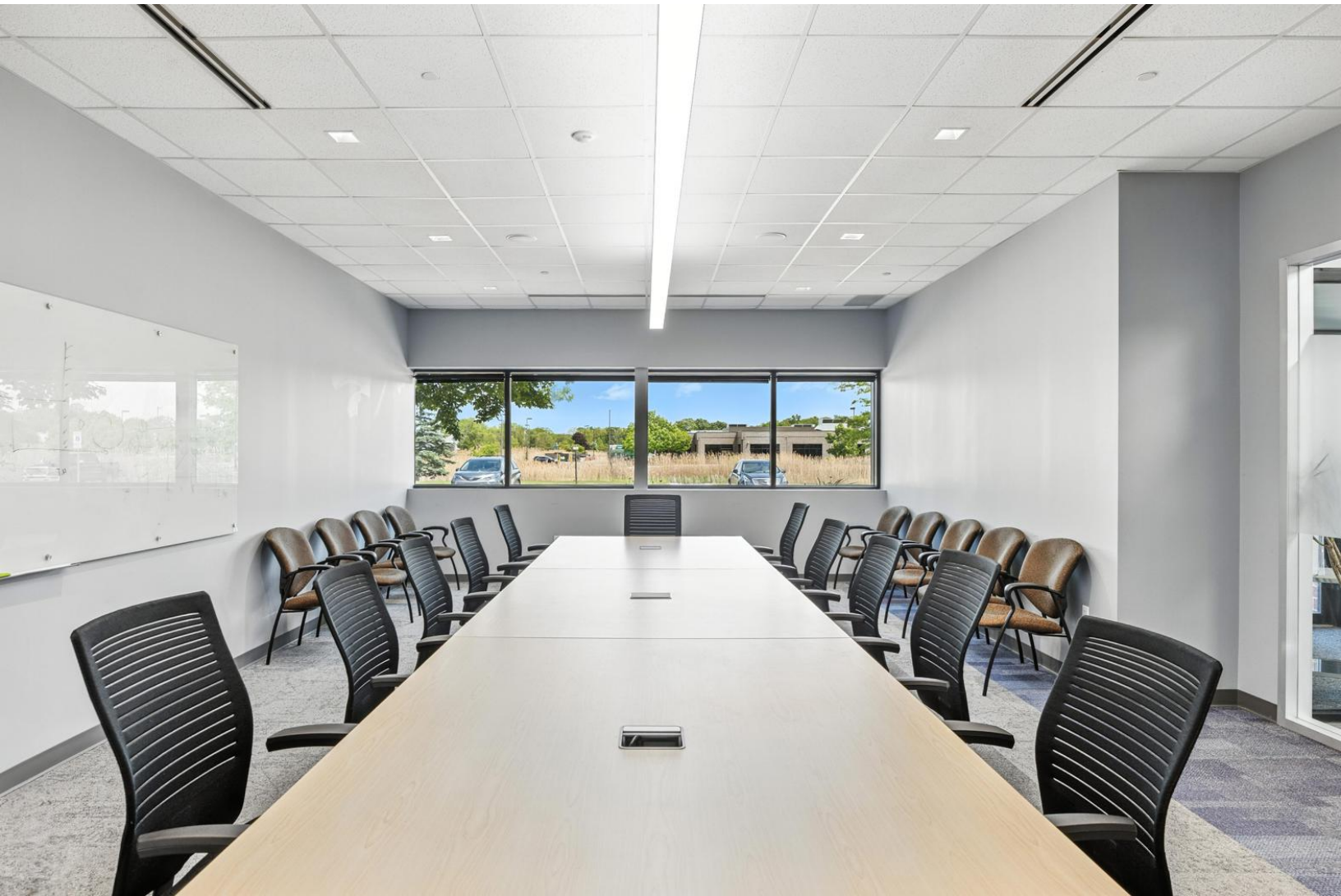
Interior, 880 Technology – Suite C